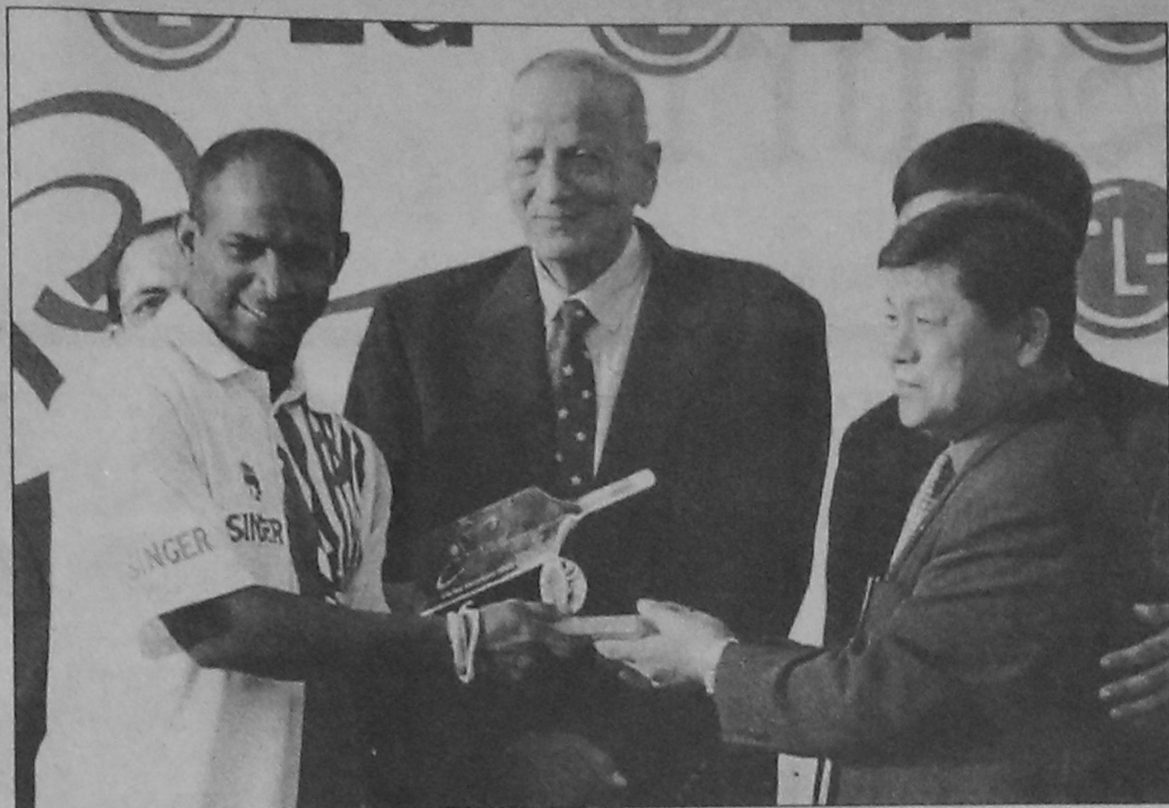
Sri Lankan skipper Sanath Jayasuriya (L) receives the LG one-day series trophy after the third and last match against Pakistan at Lahore yesterday.