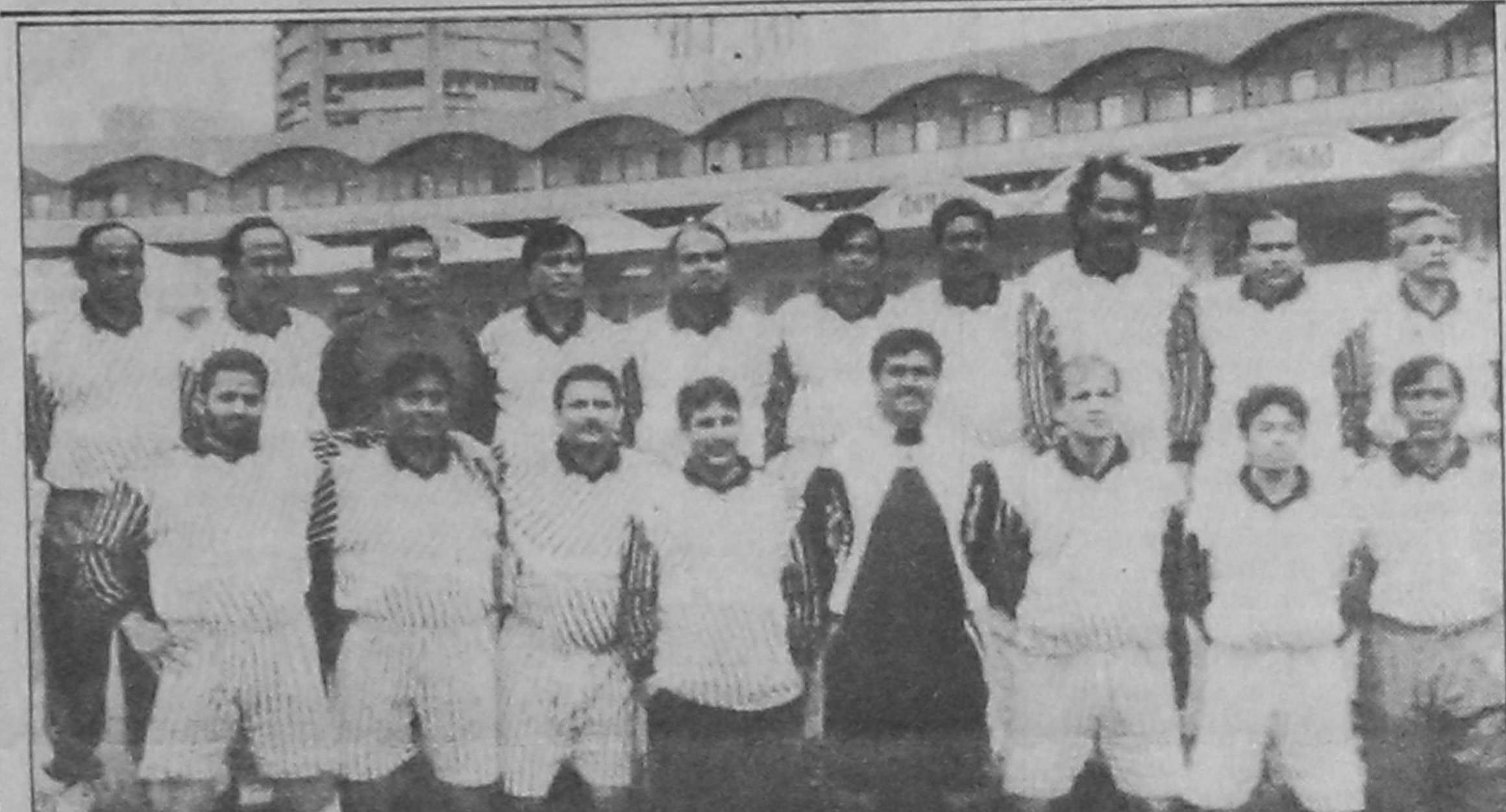
The veteran Mohammedan Sporting Club team which took part in the charity match yesterday.