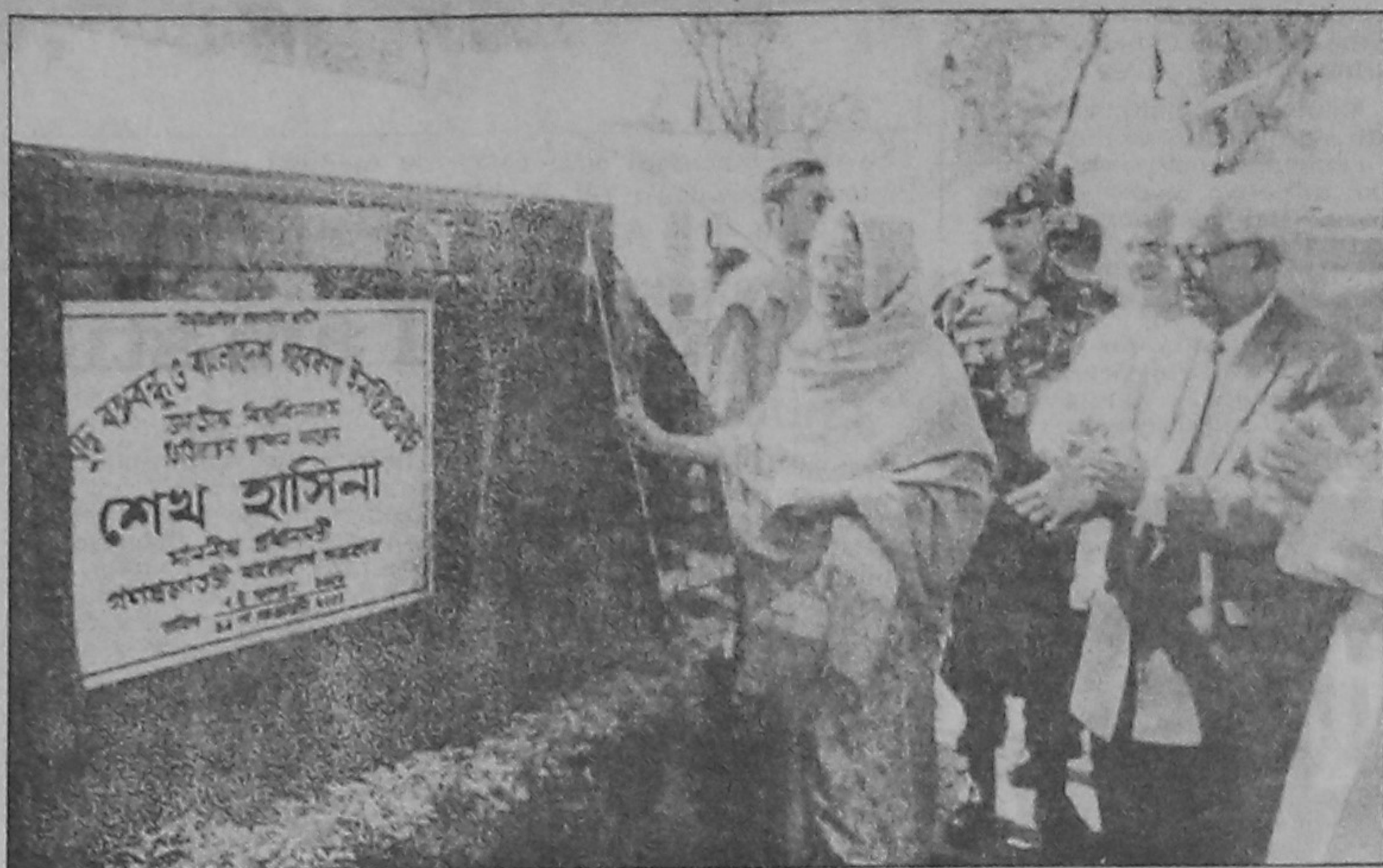
Prime Minister Sheikh Hasina unveiled the plaque of the Muktijoddha, Bangabandhu and Bangladesh Research Institute at Kushi in Gopalganj yesterday.