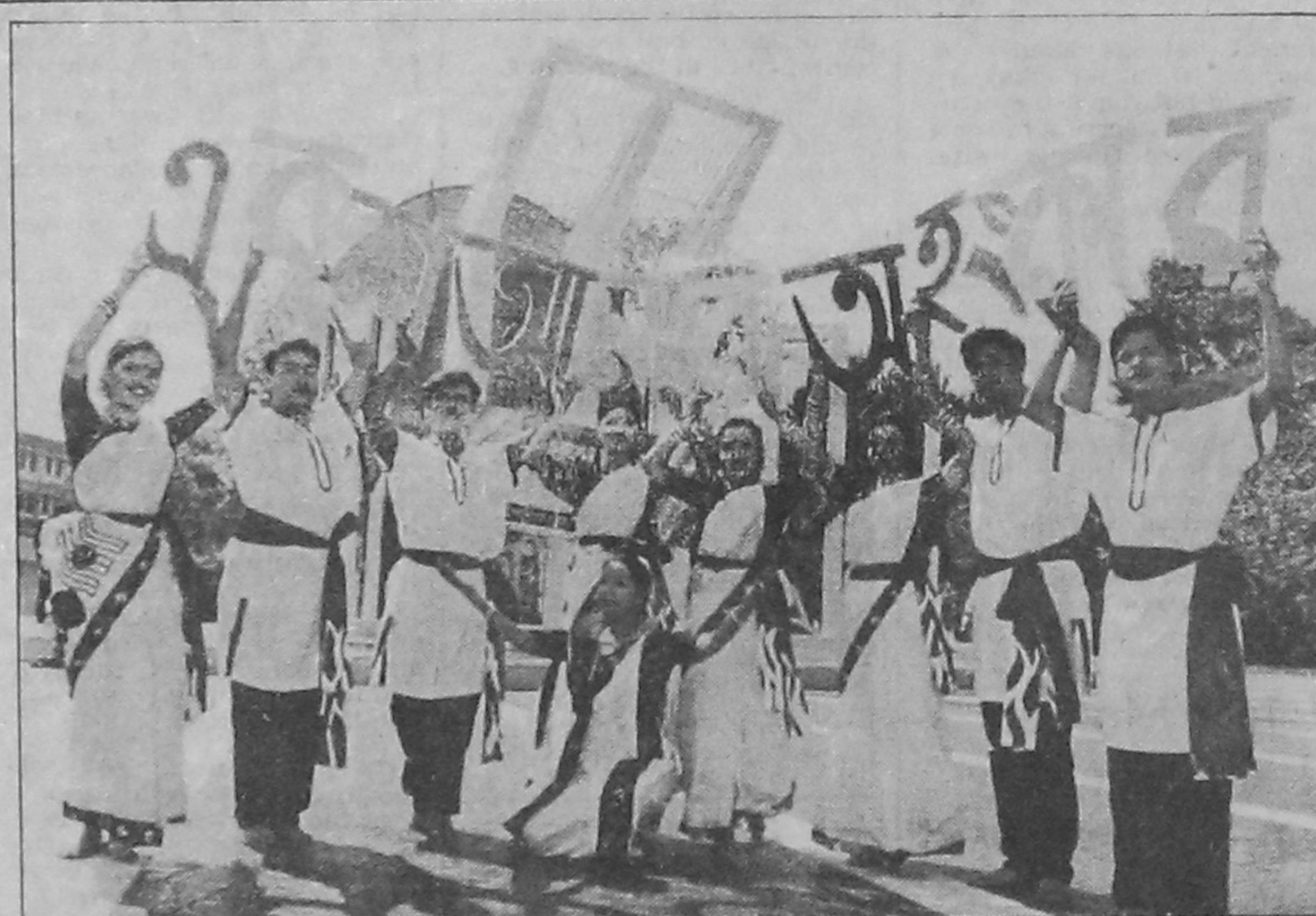
BTV artistes performing at the Central Shaheed Minar yesterday as part of its programme on Ekushey.

None was arrested till filing of this report at 7-30 pm today.