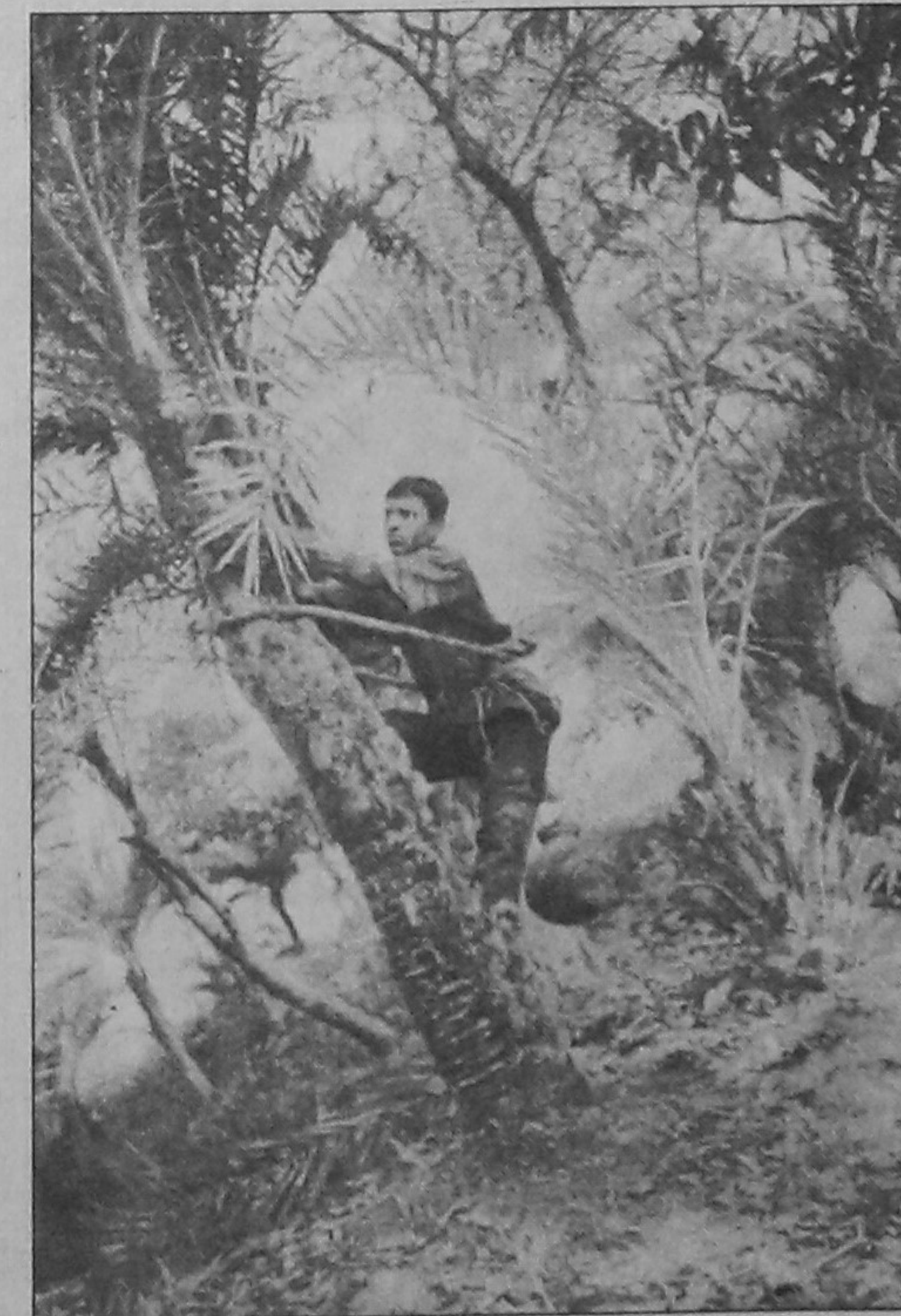
A young villager preparing for date juice extraction at a Jessore village during this ongoing season.

This can be possible only when the government comes out to patronise such projects.