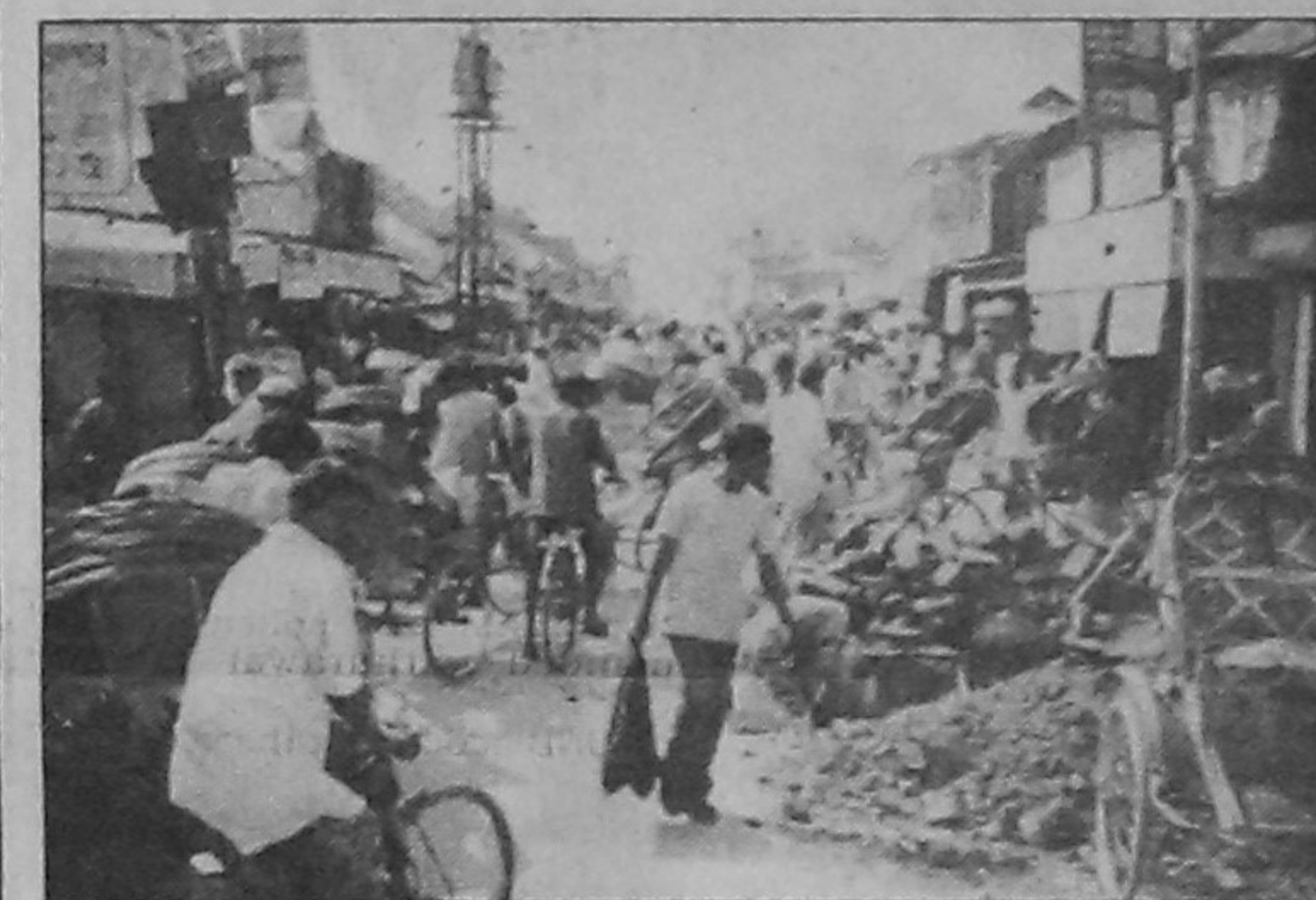
Traffic jam is a common feature in Borobazaar area situated in the middle of Sirajganj town. Haphazard parking and indiscipline movement of rickshaws are behind such unbearable jams.