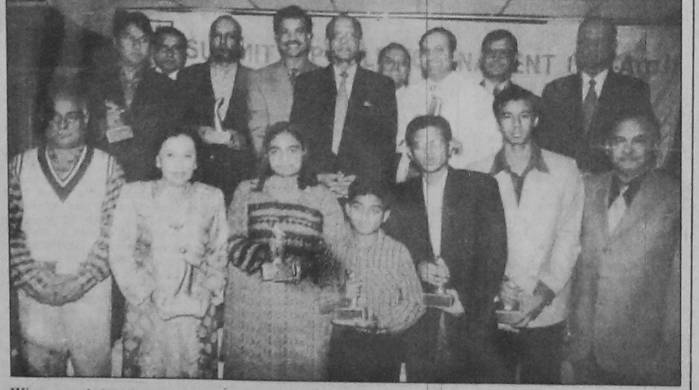
Winners of the Summit Cup tournament which was held at Kurmitola Golf Club yesterday.