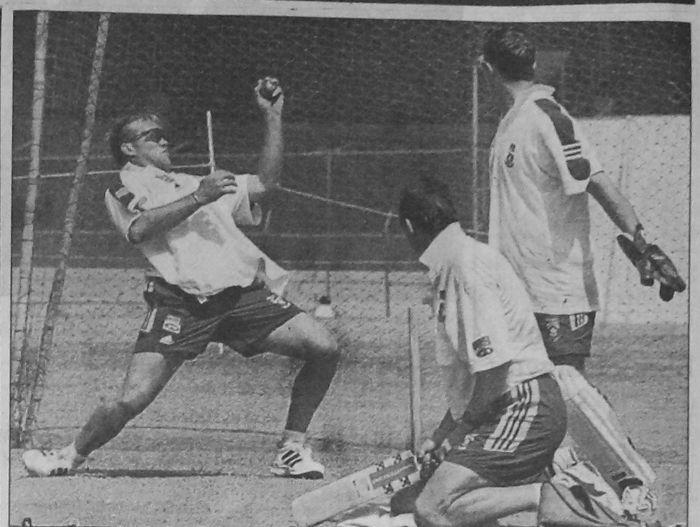
South African all-rounder Jacques Kallis (L) doing catching practice during a training session at the Brabourne Stadium in Bombay yesterday.

A budget of Tk 8.5 lakh has been allocated for the meet. Sadharan Bima will provide Tk 5 lakh and Jiban Bima Tk 3 lakh respectively.