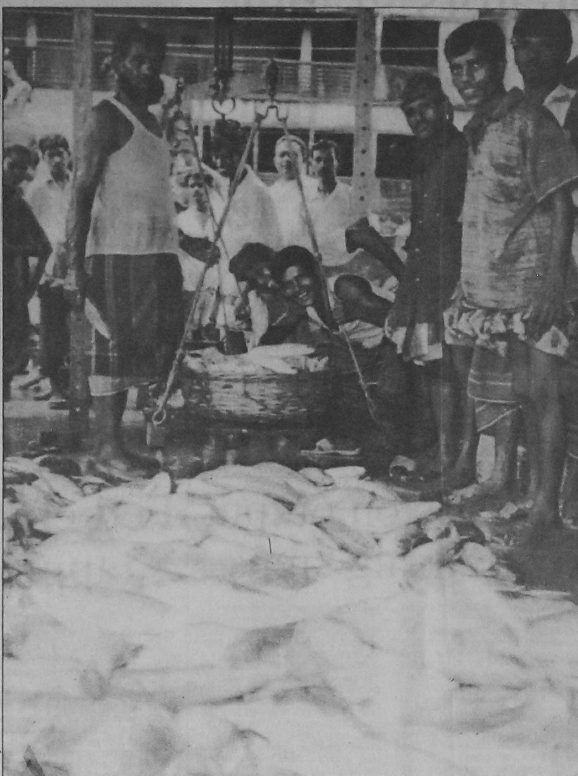
Unabated fishing of Hilsa fries in the southern districts created an acute crisis of the fish last year. Such trend is also going on this season defying the government ban. Immediate measures should be taken to check such practice. This picture was recently from a wholesale market in Barisal where trading of Hilsa fries is going on at random.

On the other hand, thousands of professional fishermen of Faridpur region have been facing numerous problems including shortage of funds and price hike of fishing materials. Earlier different kinds of fish were available in abundance in ponds, beels, canals and rivers but now the situation has