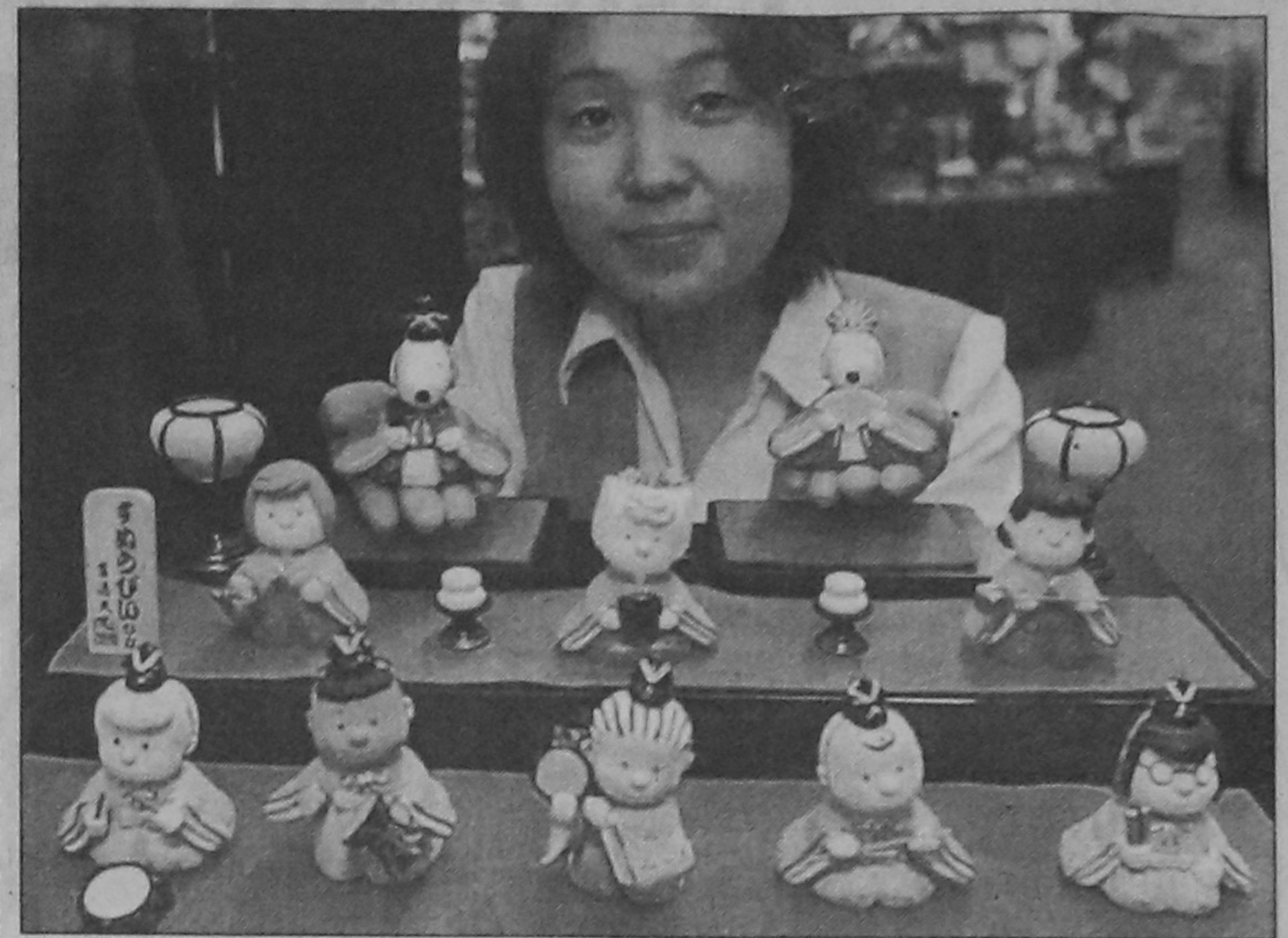
A sales girl holds dolls of Snoopy and his girl friend Bell in Kimono to show off the March 3 Girls' Festival dolls featuring characters from American comic, Peanuts, at Yoshitoku doll shop in Tokyo, Friday. Yoshitoku, used the Peanuts' characters in the Girls' Festival doll for ten years, sells a set of dolls with a price of 28,000 yen (about 255 USD) for upcoming festival.

They denounced the Thai government for erecting a fence in front of one slum directly opposite the conference center so the destitute would not be seen by the 2,000 delegations.