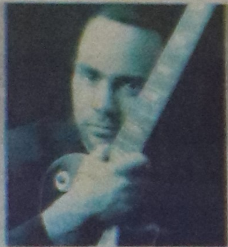
Meola won more than 20 different awards. The Guitar Player Magazine several times awarded him as the Best Jazz Guitarist and Best Acoustic Guitarist for the last three decades. His albums Kiss My Axe , World Sinfonia , Friday Night in San Francisco , Splendido Hotel , Cosino and Elegant Gypsy also won different awards for his musical skills.