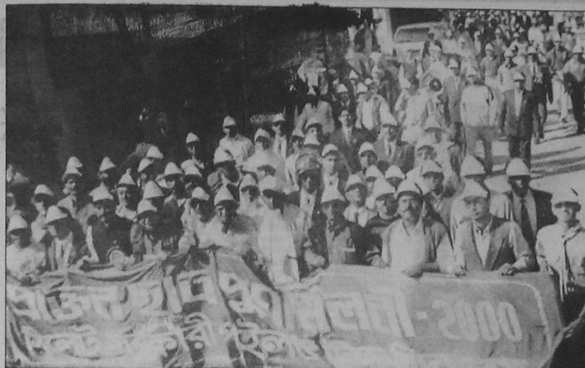
A colourful rally was brought out in Sylhet town on Friday on the occasion of a two-day reunion of the ex-students of Sylhet Government Pilot High School.

Local administration raided several markets in the town recently and realised fine from traders amounting to Tk 1,200 for selling non-iodised salt.