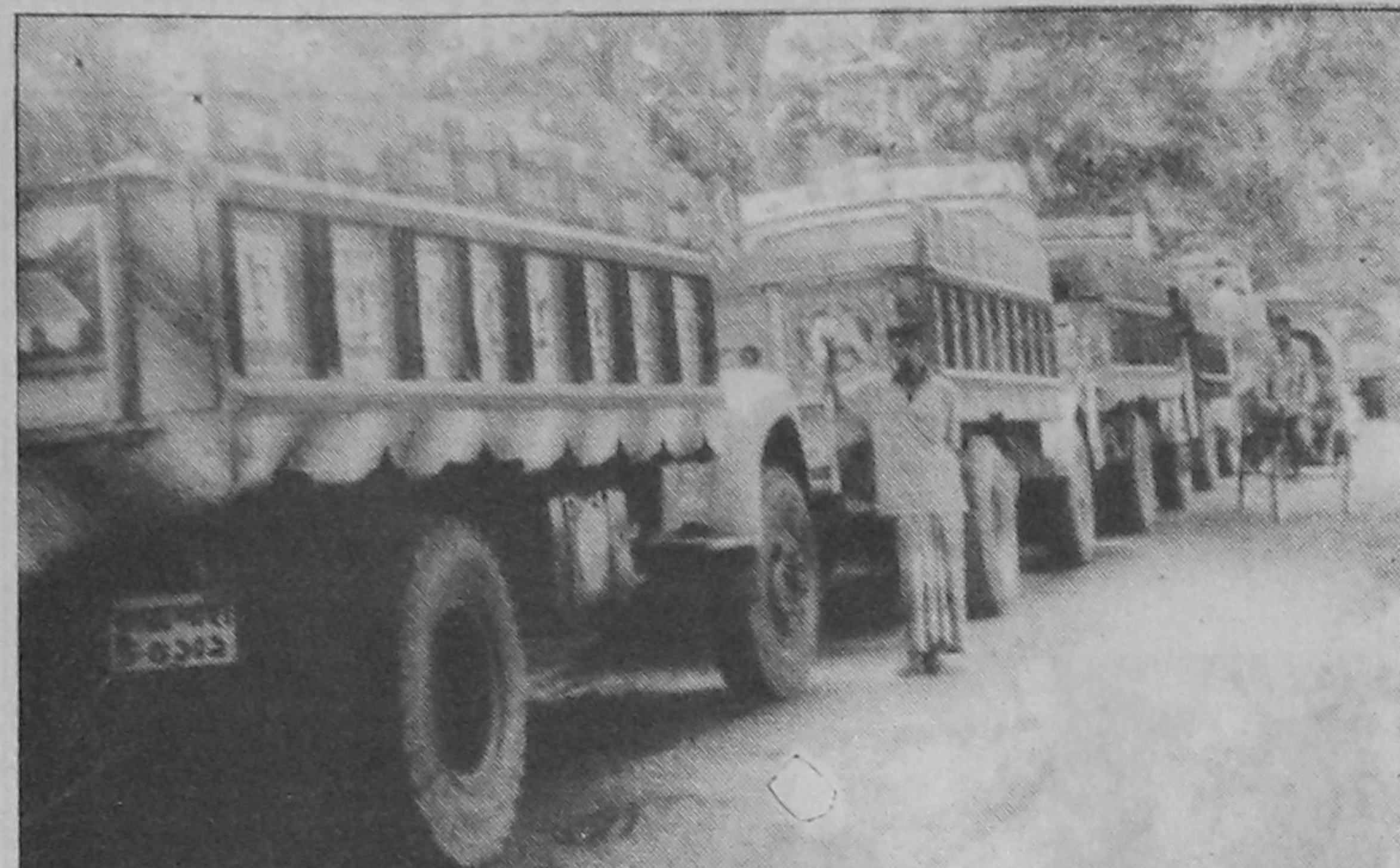
Water level has fallen sharply in the River Old Brahmaputra. As a result the ferry movement has been threatened. Photo shows many stranded loaded trucks at Jamalpur-Sherpur ferry ghat.

The government has already taken up a decision to release 50 per cent share of the total scheme among the members of the public for growing mass interest. Of the rest 50 per cent share, 15 per cent will be distributed among land owners, 20 per cent share for forest department and rest 15 per cent to non-government organisations (NGOs).