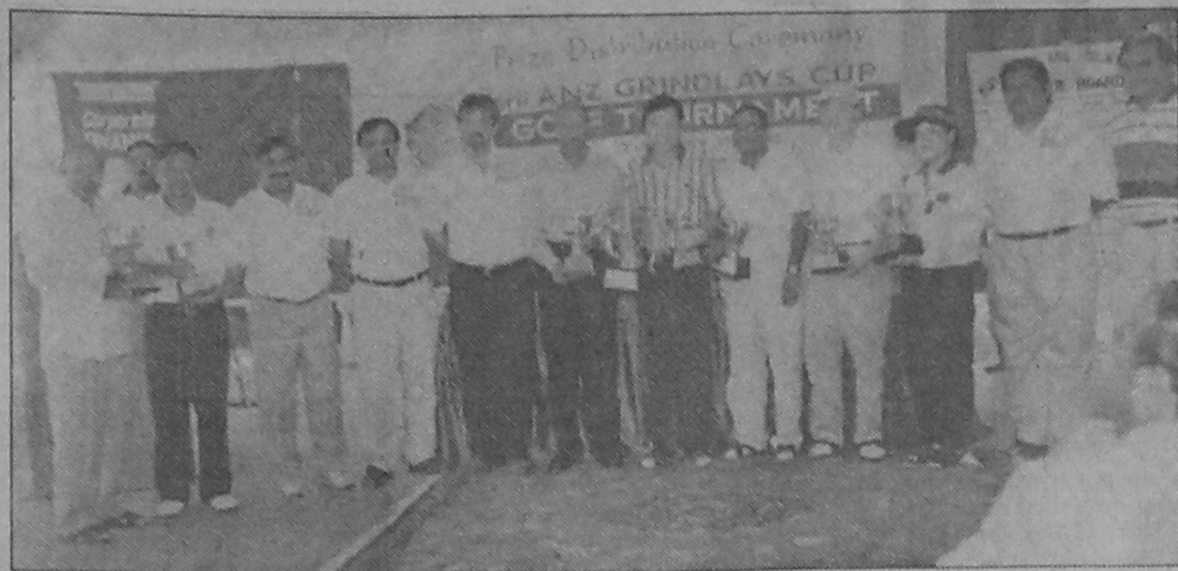
Winners of the fifth ANZ Grindlays Bank Cup golf tournament pose with their trophies at the Bhatia Golf & Country Club in Chittagong on February 11.