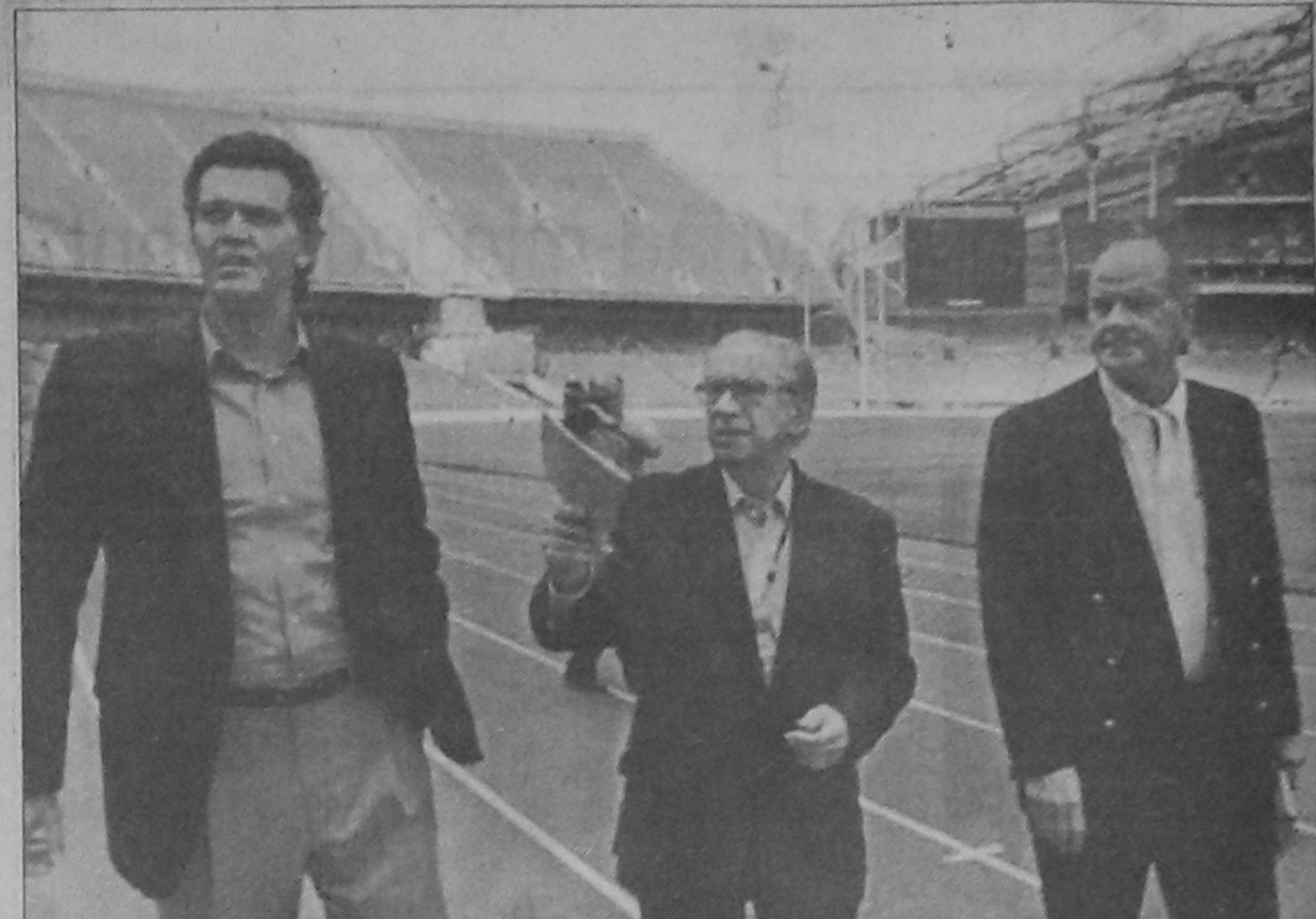
International Olympic Committee President Juan Antonio Samaranch (C) inspecting the Sydney Olympic Stadium yesterday.

"We made it clear two weeks ago that the game as a whole must improve its conduct and image."