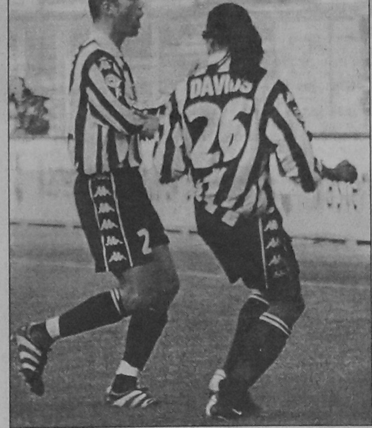
Juventus' French star Zinedine Zidane (L) celebrates after scoring against Lecce in their Serie A match on February 13. His Dutch teammate Edgar Davids joins in the fun.

Inter Milan also struggled and needed a 31st minute equaliser from a revitalised