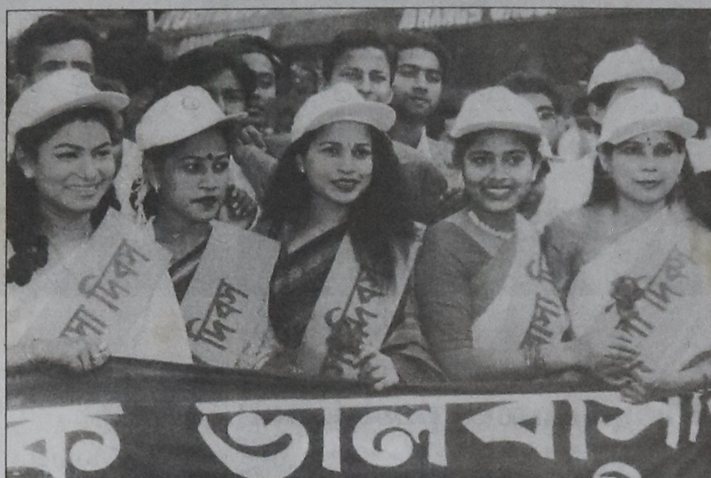
A colourful procession was brought out from the TSC of Dhaka University yesterday marking the Valentine's Day.