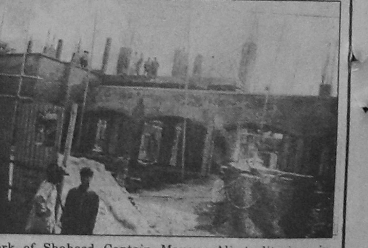
Work of Shaheed Captain Mansur Ali Auditorium in Mujib Sarak area of Sirajganj town progressing fast.

Official sources said 777 tube-wells, including Tara deep-set ones, out of 26,989 tubewells remained inoperative for long. Thana-wise break-up of the inoperative tube-wells are: 100 each in Sadar and Karimganj thanas, 88 each in Tarail and Hossainpur, 83 in Katiadi, 64 in Bajitpur, 63 in Nikli, 62 in Bhairab, 39 in Kulliarchar, 37 in Ausatganj, 42 in Matamain and 11 in Pakundia. A PHED official said there were 45 mechanics here which was too inadequate to repair and maintain such a large number of tubewells.