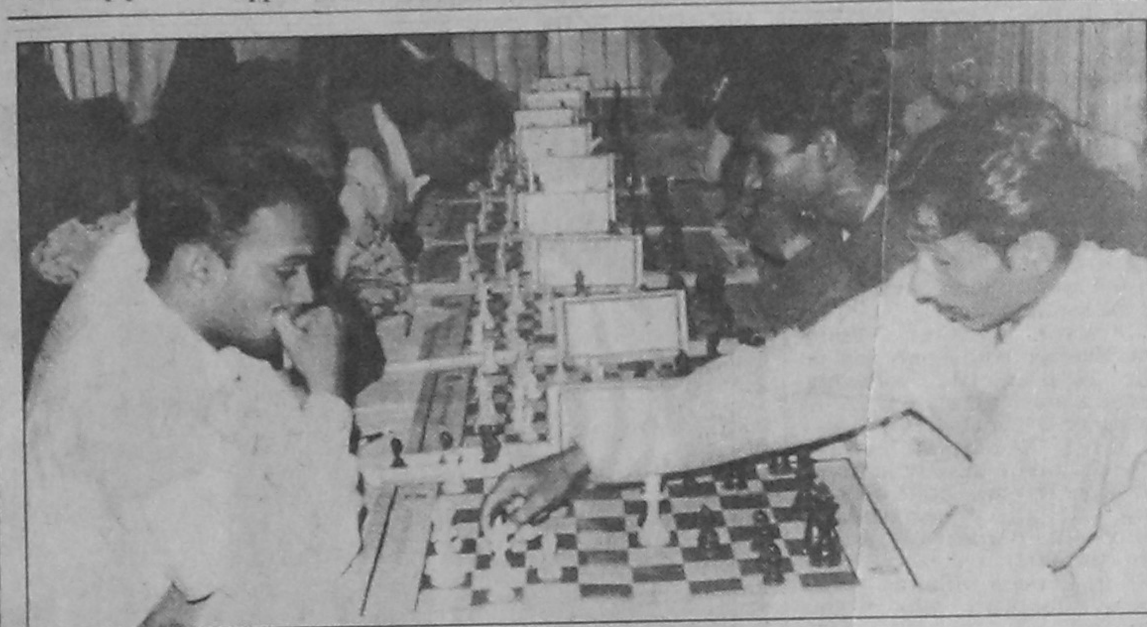
Scene from the 26th national chess championship qualifiers at the NSC yesterday.