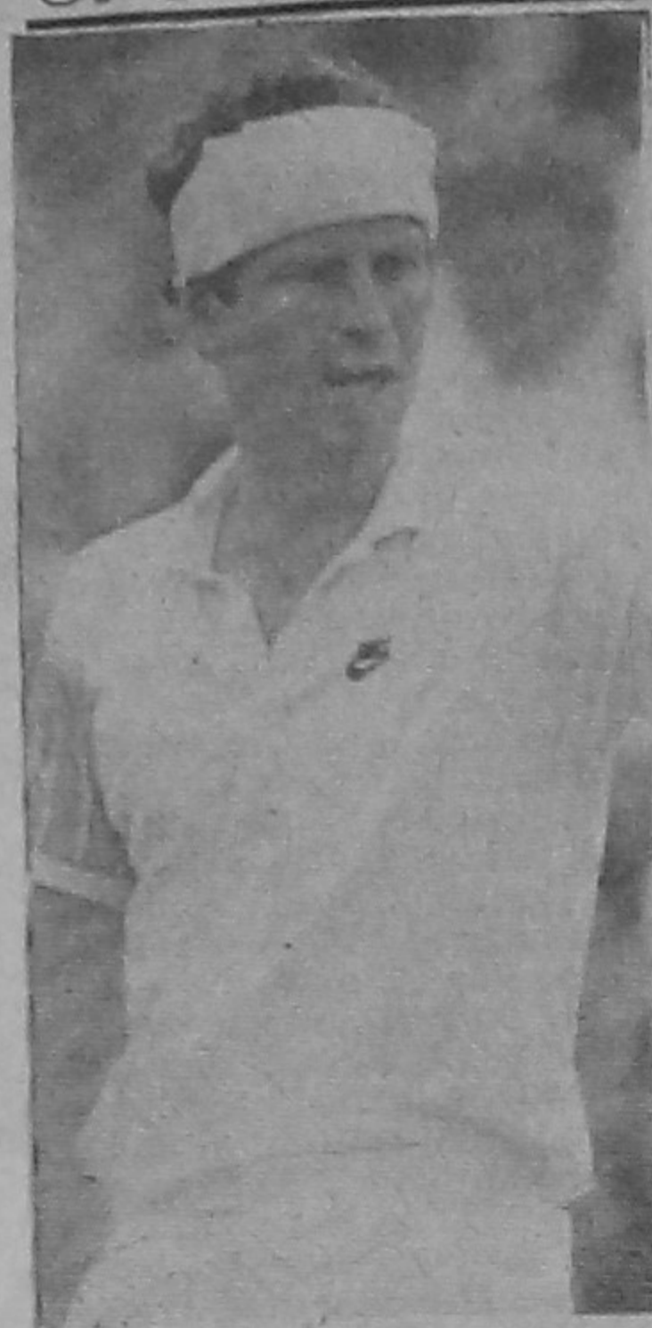
John McEnroe (American tennis legend) "People used to mock that my behaviour went too far."