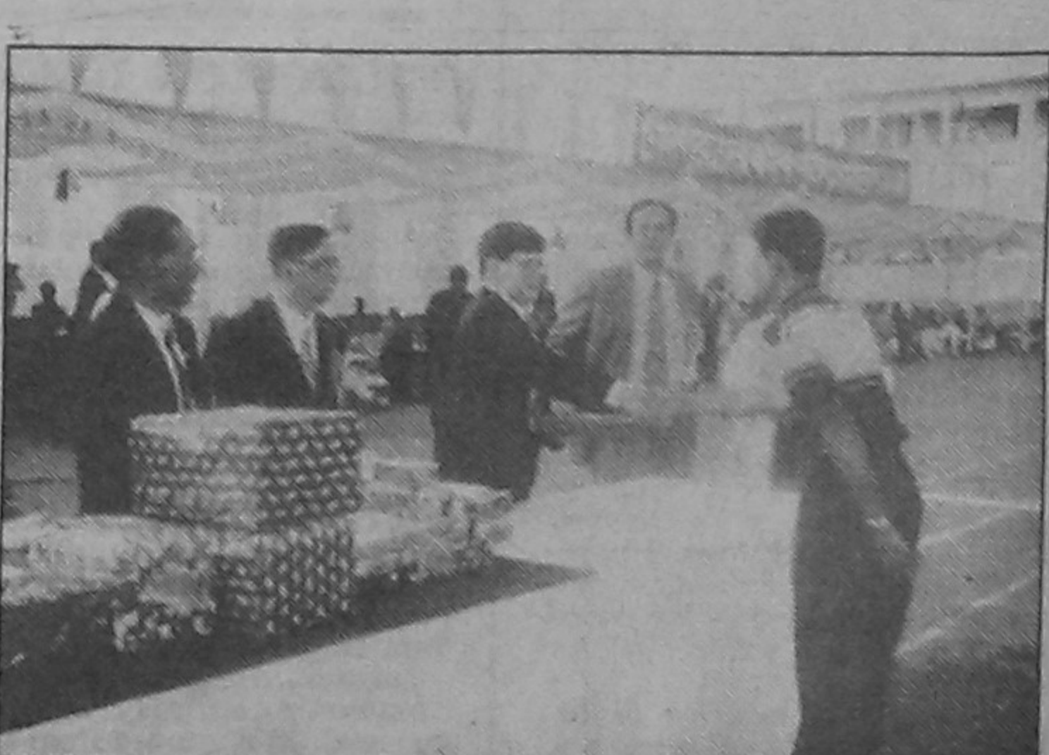
Inspector General of Police distributing prizes recently at the Annual Sports Meet of Chandpur Police.

Of the sanctioned amount, Taka 8.35 crore has already been disbursed among the farmers. The loan is being disbursed for cultivation of Aus, Boro wheat, banana, maize and vegetables, pisciculture, cattle rearing and other poverty alleviation programmes.