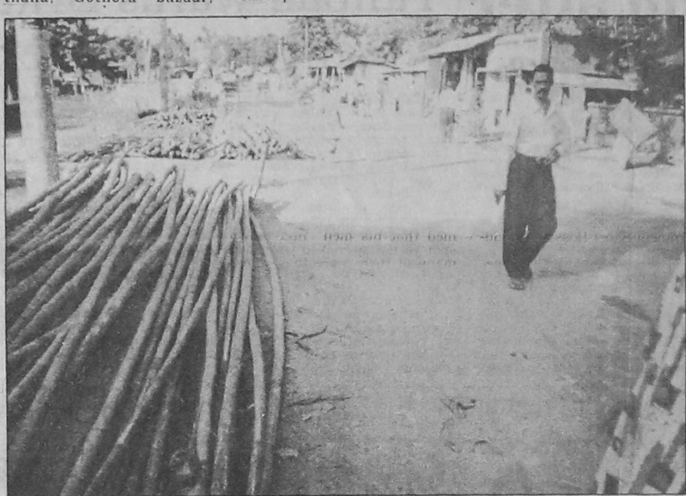
Traders keep bamboo in roadside places along a road in Challisha Bazaar under Netrakona Sadar thana, causing inconveniences to people, especially pedestrians.

Local people have urged the authorities concerned to take immediate measures to solve the problem.