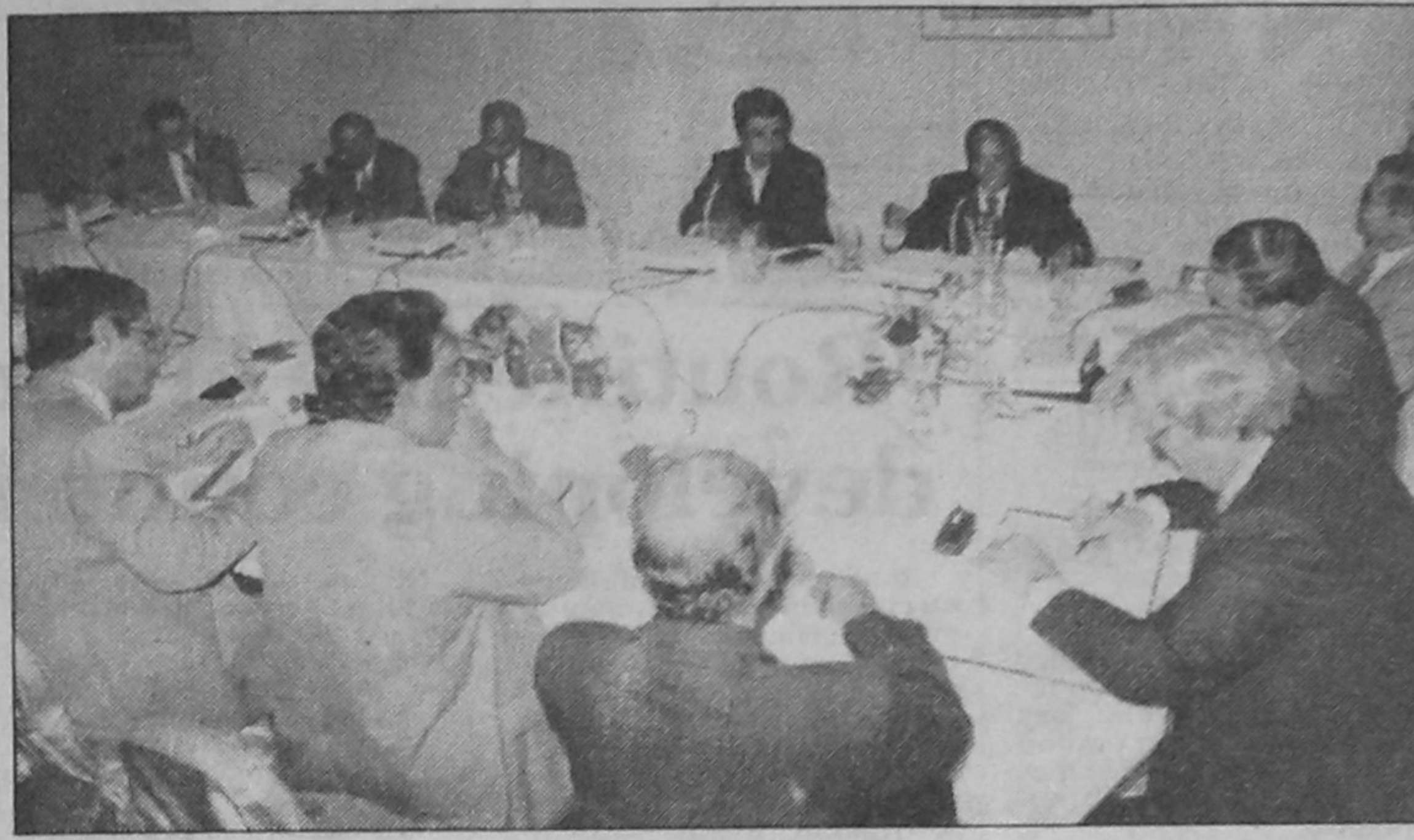
The Daily Star roundtable in progress at Sheraton Hotel yesterday.