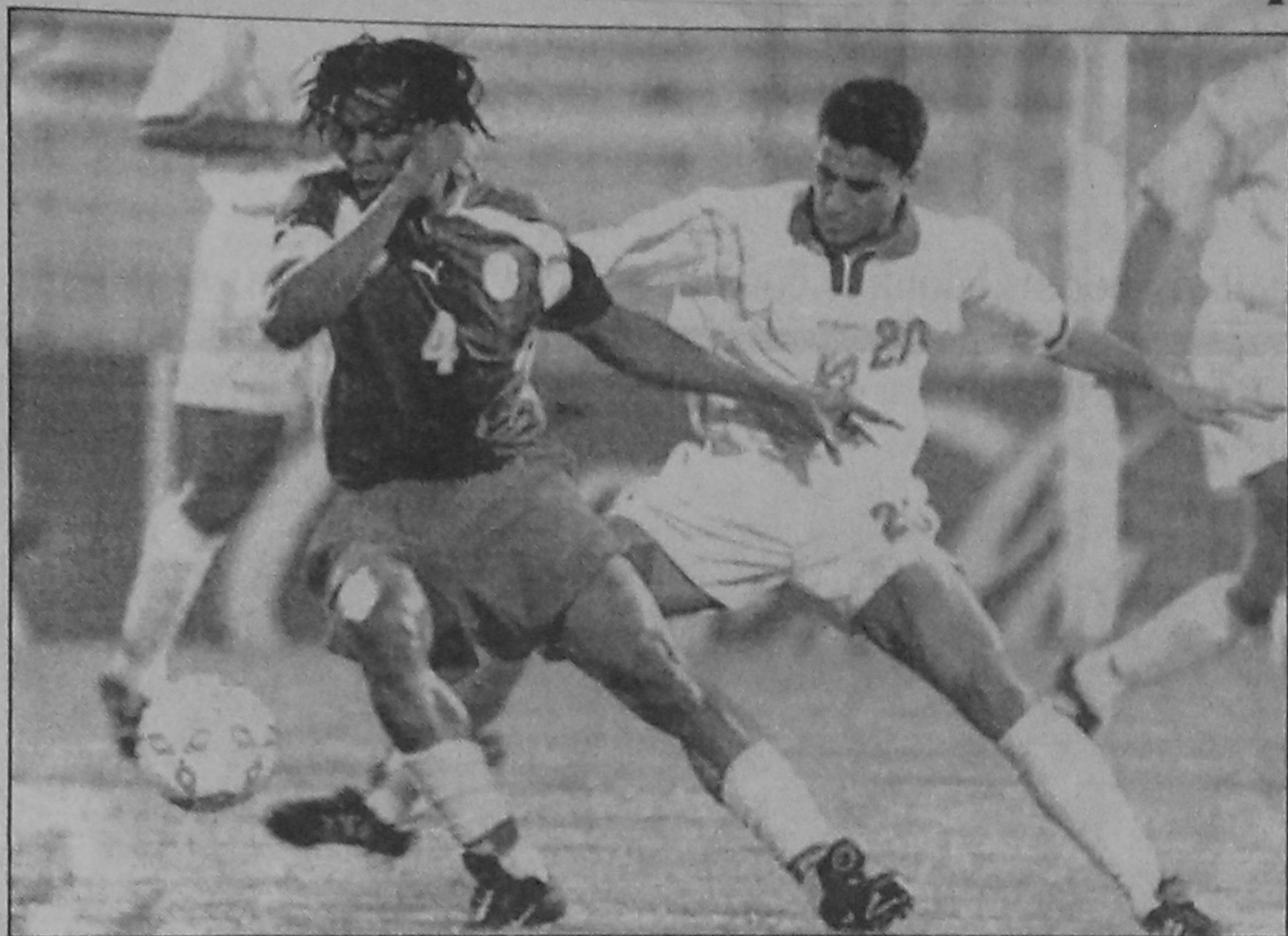
Rigobert Song (L) of Cameroon battling for control against Tunisia's Jaziri Zied during their African Nations' Cup semifinal at Accra on February 10.

Only 8,000 fans bothered to turn up at the Stadio Olimpico and in truth the Venezia players must have bothered if the effort had been worth it.