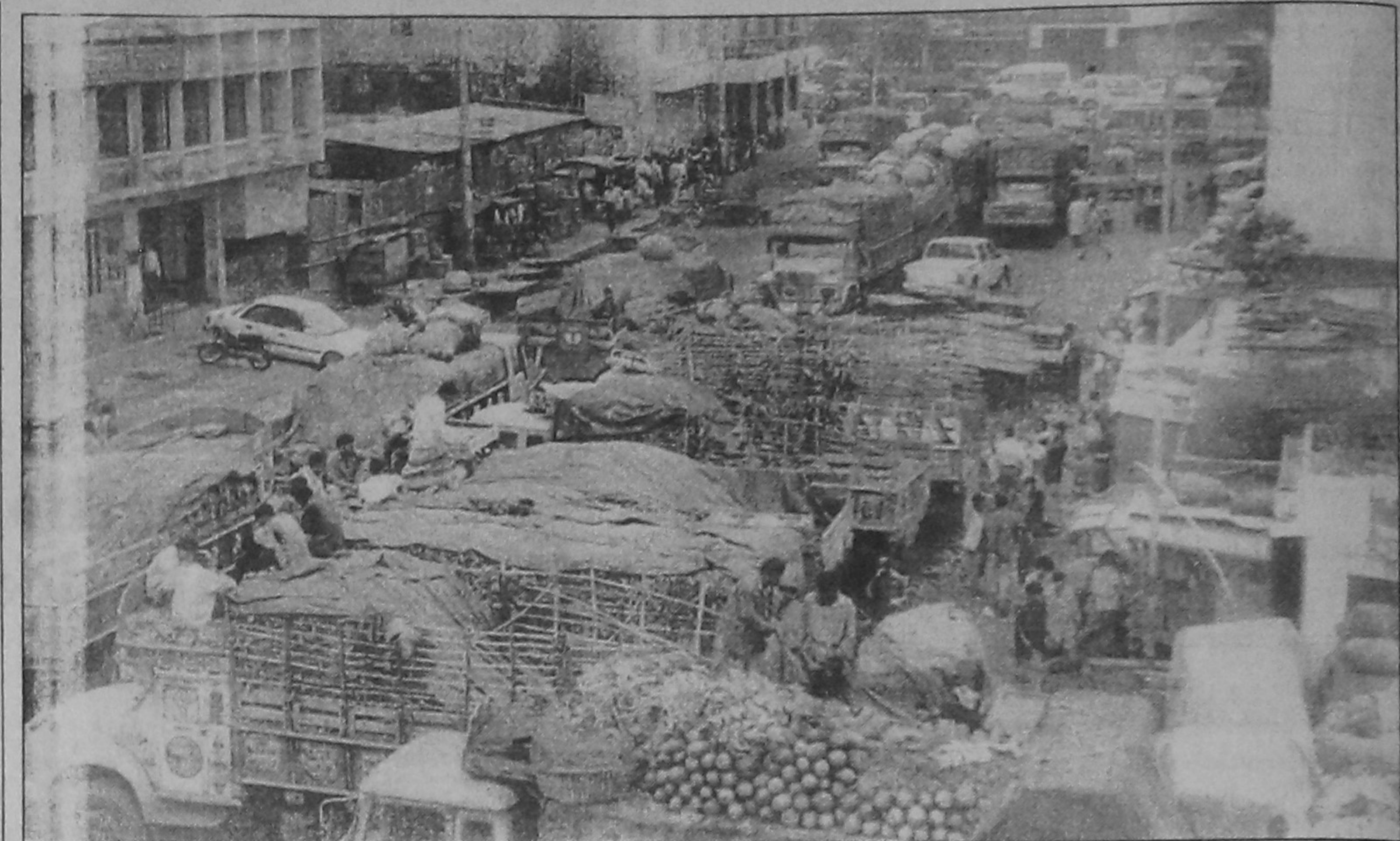
Trucks are parked haphazardly on the road at Karwanbazar in the city greatly hindering traffic movement.

Ten dwelling houses were gutted rendering about one hundred people homeless.