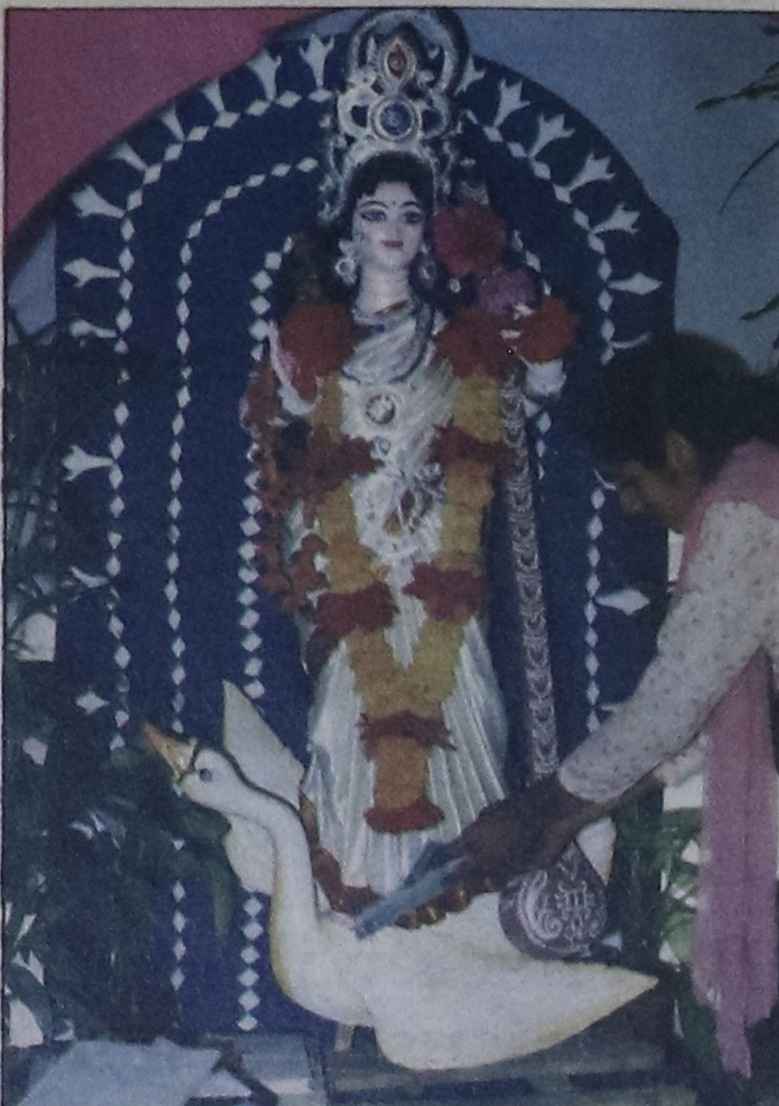
For knowledge A devout performs Saraswati Puja rituals.

Relatives of most of the accused were found loitering in the court compound. But police did not allow any of them to go near to the accused breaking the cordon.