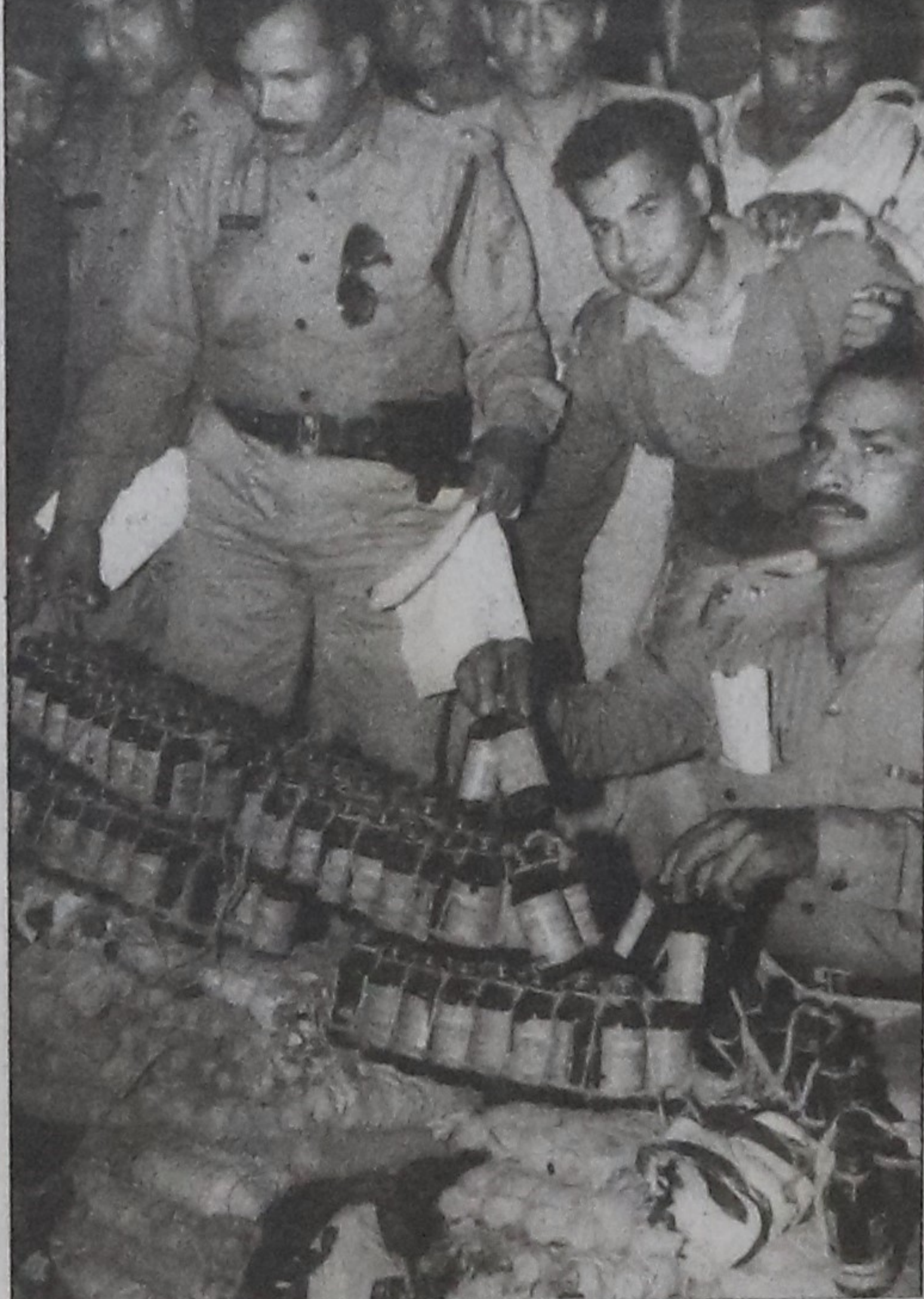
COMBING OPERATION: Police recovered 231 bottles of phensidyl from major slums in the city yesterday.

They said such old-edition books have bigger markers in district towns and remote areas where NCTB's monitoring net- See page 11 col 7