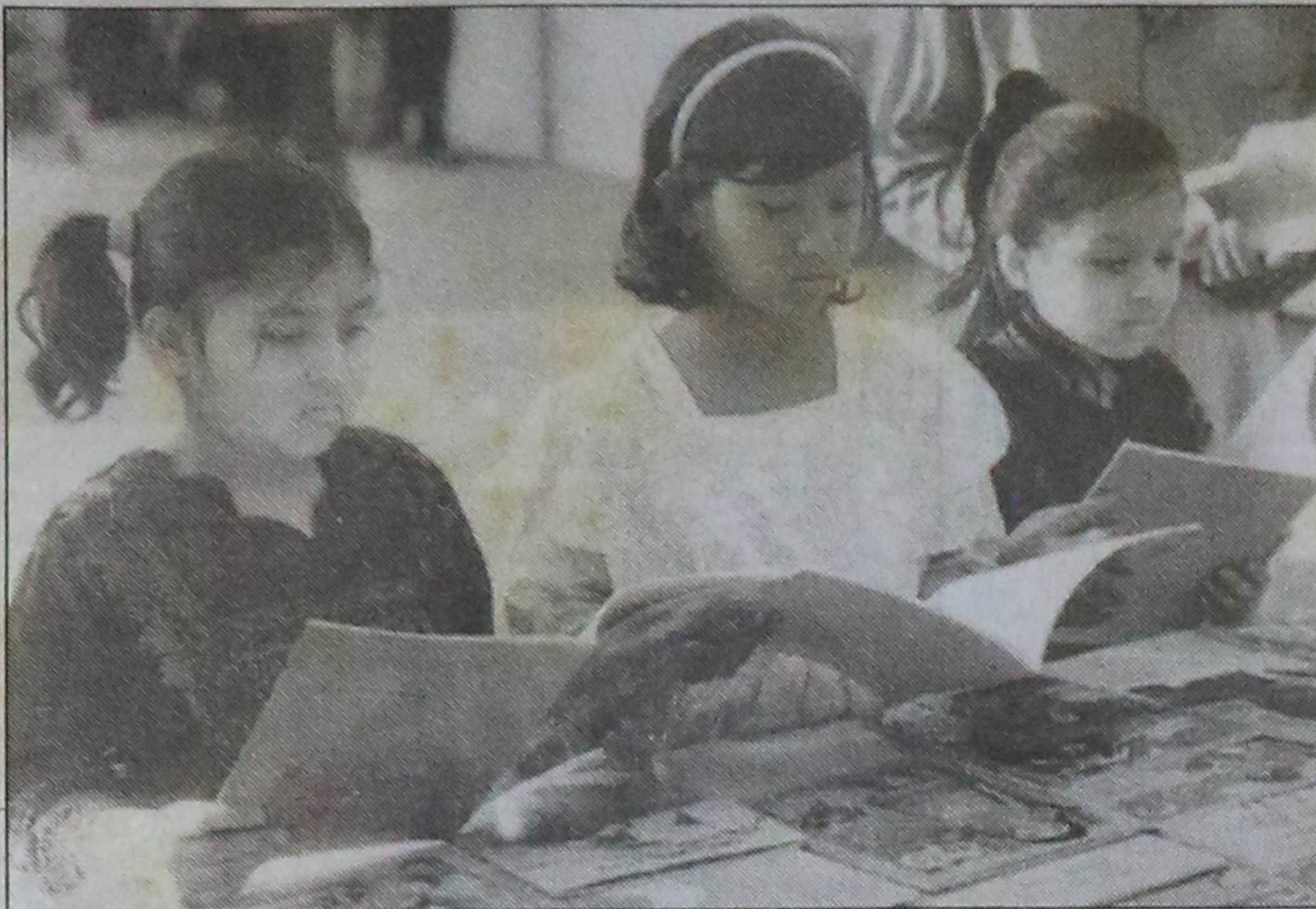
Children corner is the new addition to this year's Boi Mela