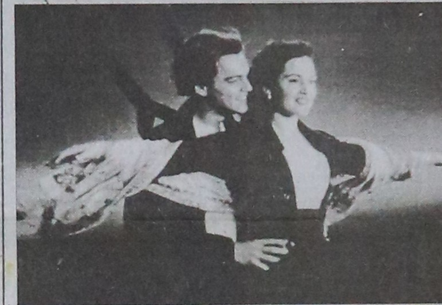
Titanic (14/02/2000, 10:00 pm)

Each day in Hollywood, an exciting assortment of talent streams through the studio gates. Joining them on the sound stages are Toons, the colourful stars and superstars of cartoons who commute from Toontown, the suburb of Hollywood where down is up, up is down and anything goes. Roger Rabbit is a veteran Toon contract player. He's a floppy-eared, lovable stunt clown who loves everybody, especially his gorgeous wife, Jessica. Although some vicious gossip about her has lately been affecting his work in front of the camera, nothing compares to what he faces when he becomes the prime suspect in a sensational murder case.