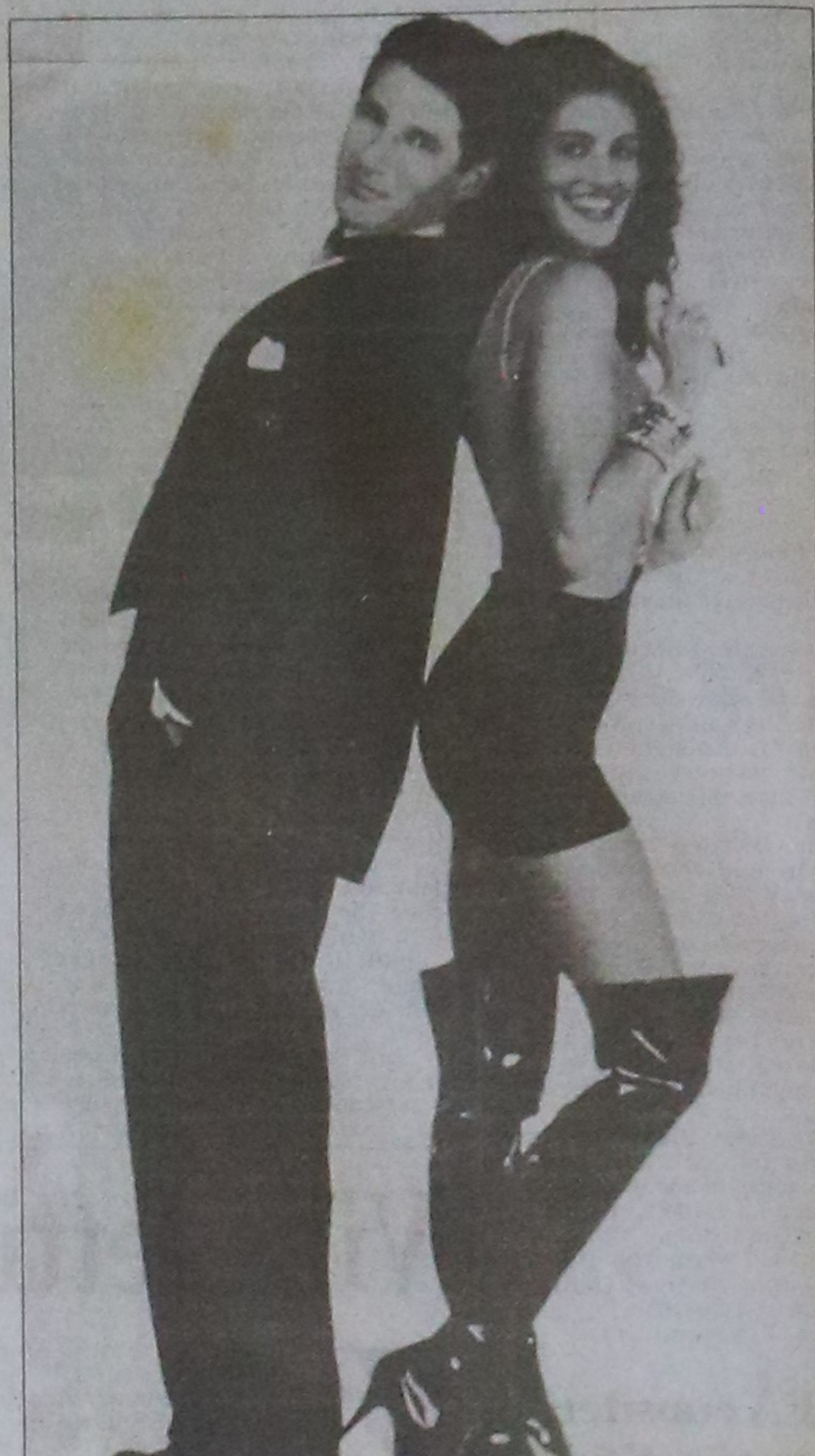
Pretty Woman (17/02/2000, 10:00 pm)

Starring Julia Roberts and Richard Gere.