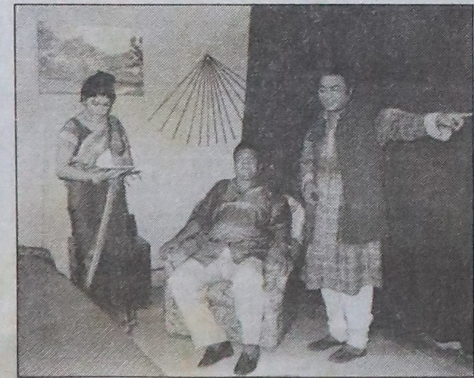
A scene from the drama Valentiner Golap Phool

On a Valentine's Day when the whole family was getting ready to go to a wedding reception Saju, a friend of Dipti