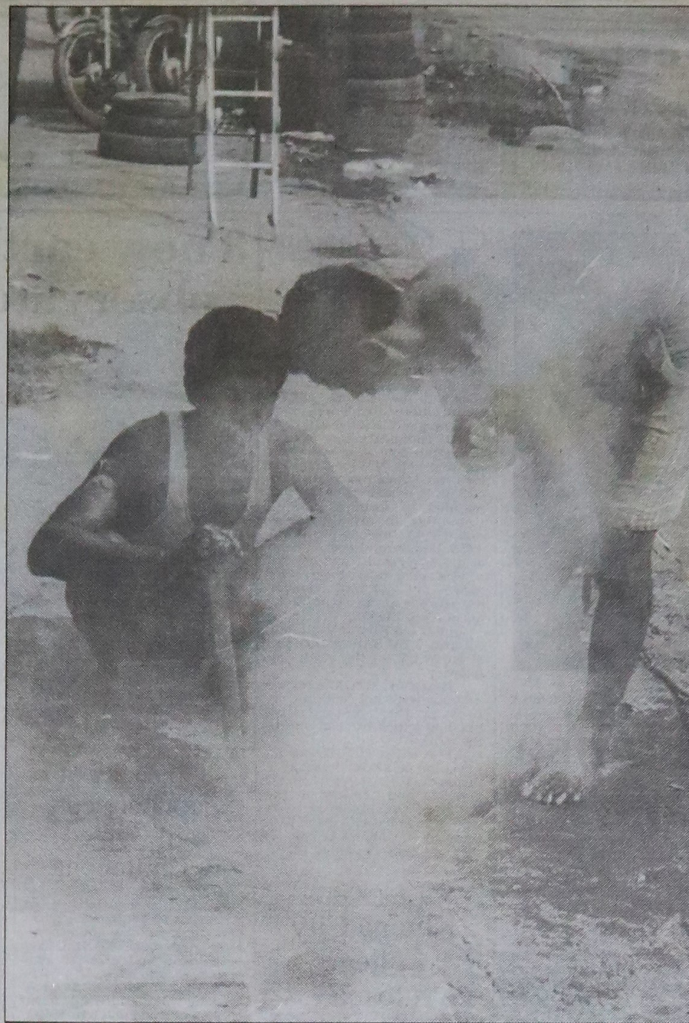
Fumes engulf two men as they open the cover of a manhole at Bijoy Nagar area to clean it.

He also informed the Minister that they had recently started an Al Azhar Institute in Dhaka.