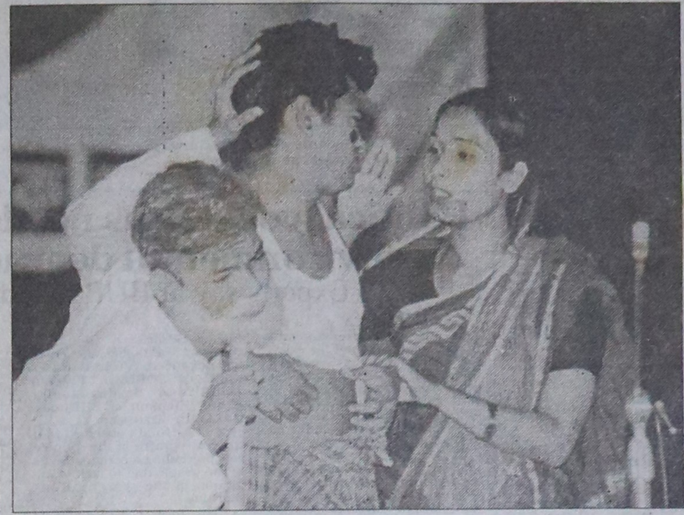
A sequence from the street drama 'Bibi Chhab' presented by Sarak at the Central Shaheed Minar in the city yesterday.