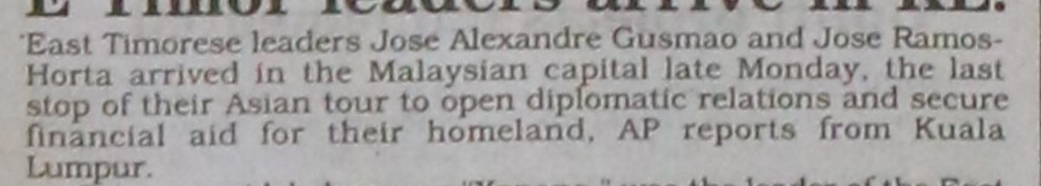
East Timorese leaders Jose Alexandre Gusmao and Jose Ramos Horta arrived in the Malaysian capital late Monday, the last stop of their Asian tour to open diplomatic relations and secure financial aid for their homeland, AP reports from Kuala Lumpur.