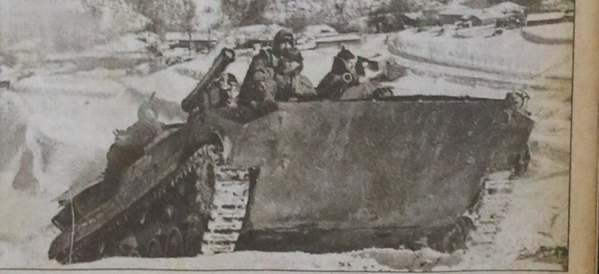
With a snow-capped terrain talking the background Russian soldiers ride on a tank towards a new position near the village of Vedenov, in southern Chechnya on Monday. Russian forces over the weekend killed hundreds of Chechen rebels who were fleeing Grozny and running for cover towards the southern mountains, according to reports.

The paper said the lifting of US sanctions was Pyongyang's right, not a gift, and stressed that above all else North Korea cherished its independence and sovereignty and would not be beholden to Washington. "It will be a great miscalculation if the US thinks that it can frighten us or isolate and stifle our socialism through economic pressure," it said.