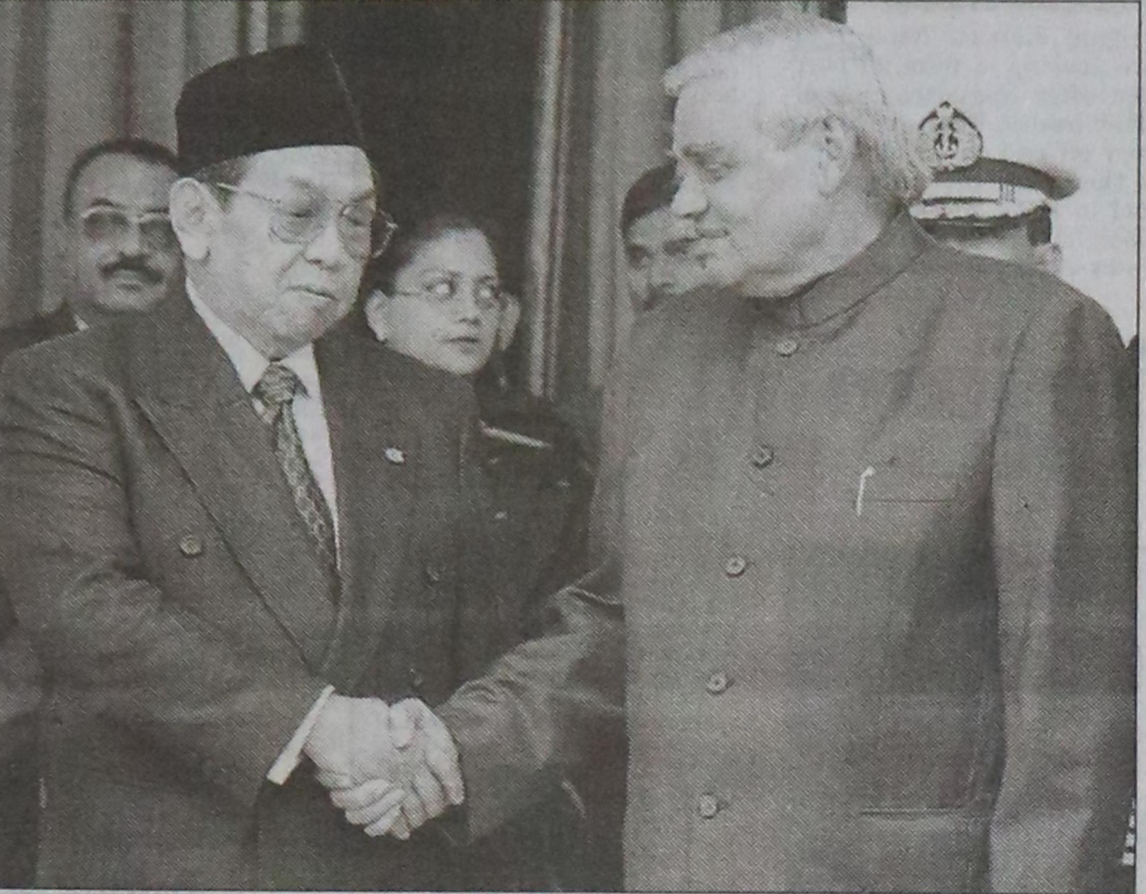
Indonesian President Abdurrahman Wahid (L) shakes hands with Indian Prime Minister Atal Behari Vajpayee prior to their talks at the Hyderabad House yesterday following a welcoming ceremony at the presidential palace in New Delhi. Wahid is on a two-day official visit to India, as part of a larger world tour.