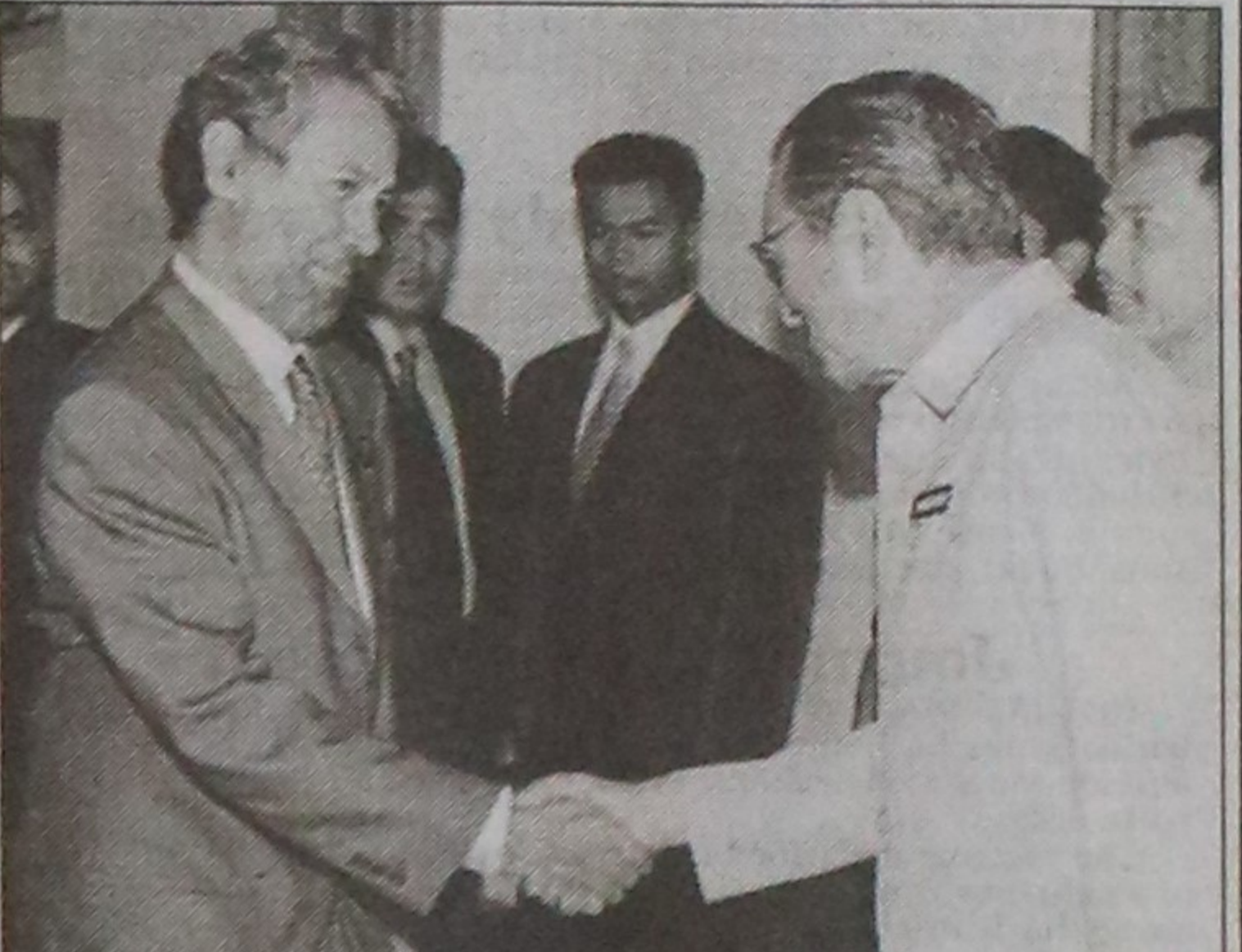
East Timorese independent leader Xanana Gusmao (L) is welcomed by Malaysian Prime Minister Mahathir Mohamad at the latter's office in Putrajaya yesterday.