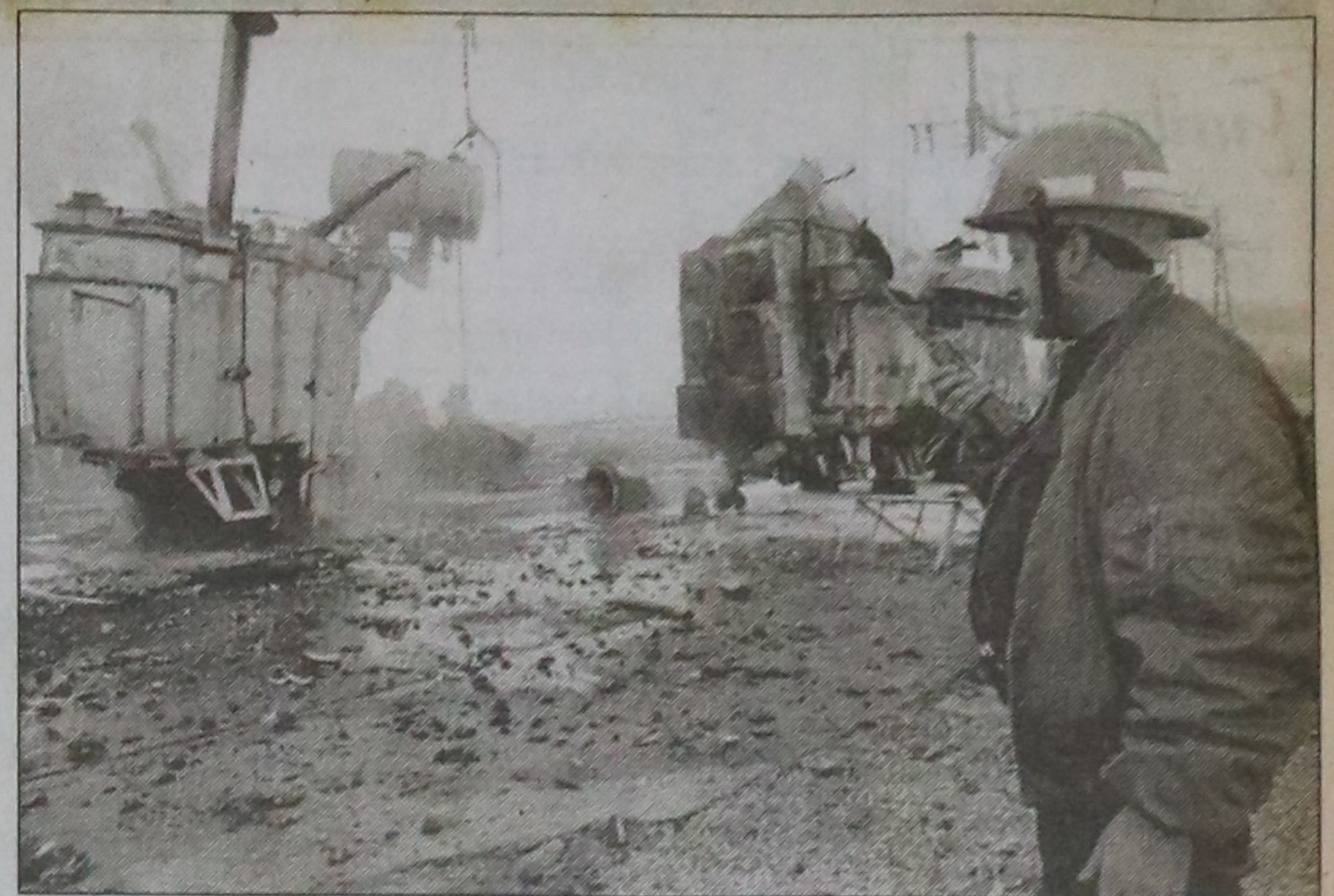
A firefighter speaks on his radio next to the wreckage of the Deir Nbuuh power station yesterday. Israeli aircraft knocked out three power stations in Lebanon, plunging town and villages into darkness and injuring 18 civilians in retaliation for guerrilla attacks on Israeli troops in the south.

tacks on three power plants in Lebanon were in response to "the severe escalation in the activities of Hezbollah and other organisations in south Lebanon." Tuesday's raids came hours after Israeli Prime Minister Ehud Barak's Security Cabinet ordered a "harsh military response," according to a senior Israeli official who spoke on condition of anonymity.