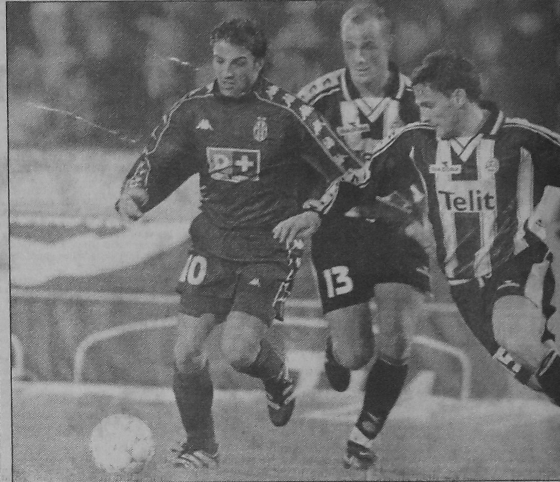
Alessandro Del Piero (L), the Juventus star, being closely followed by two Udinese defenders during a Serie A game at Udine on February 5.

The Super Eagles beat hosts Senegal 2-1 in the opening match of the 1992 finals and the countries drew 1-1 in Dakar last year in a qualifier later scratched from the records when Nigeria replaced Zimbabwe as hosts.