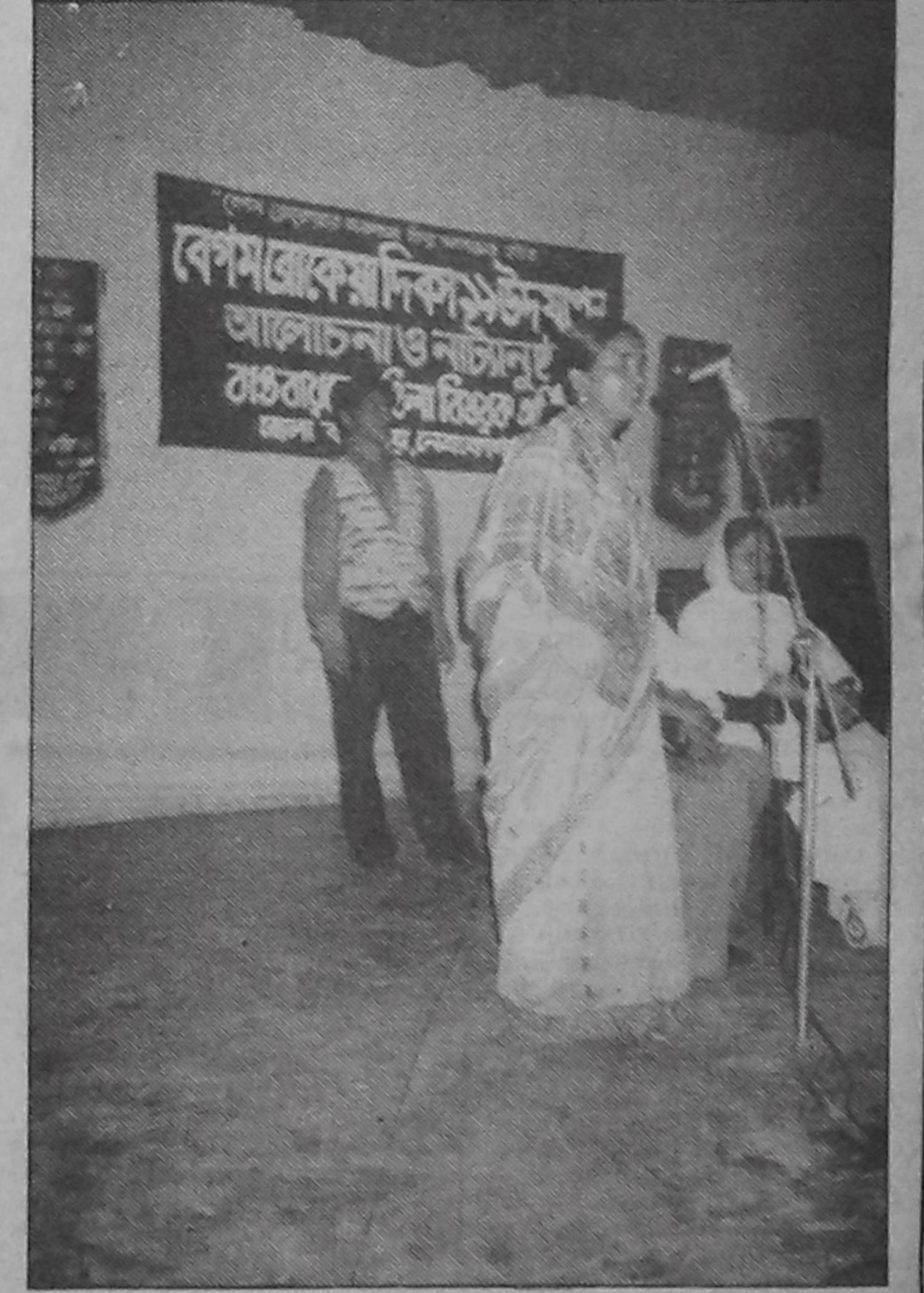
A discussion meeting in progress in Netrakona town on the occasion of Rokeya Day.