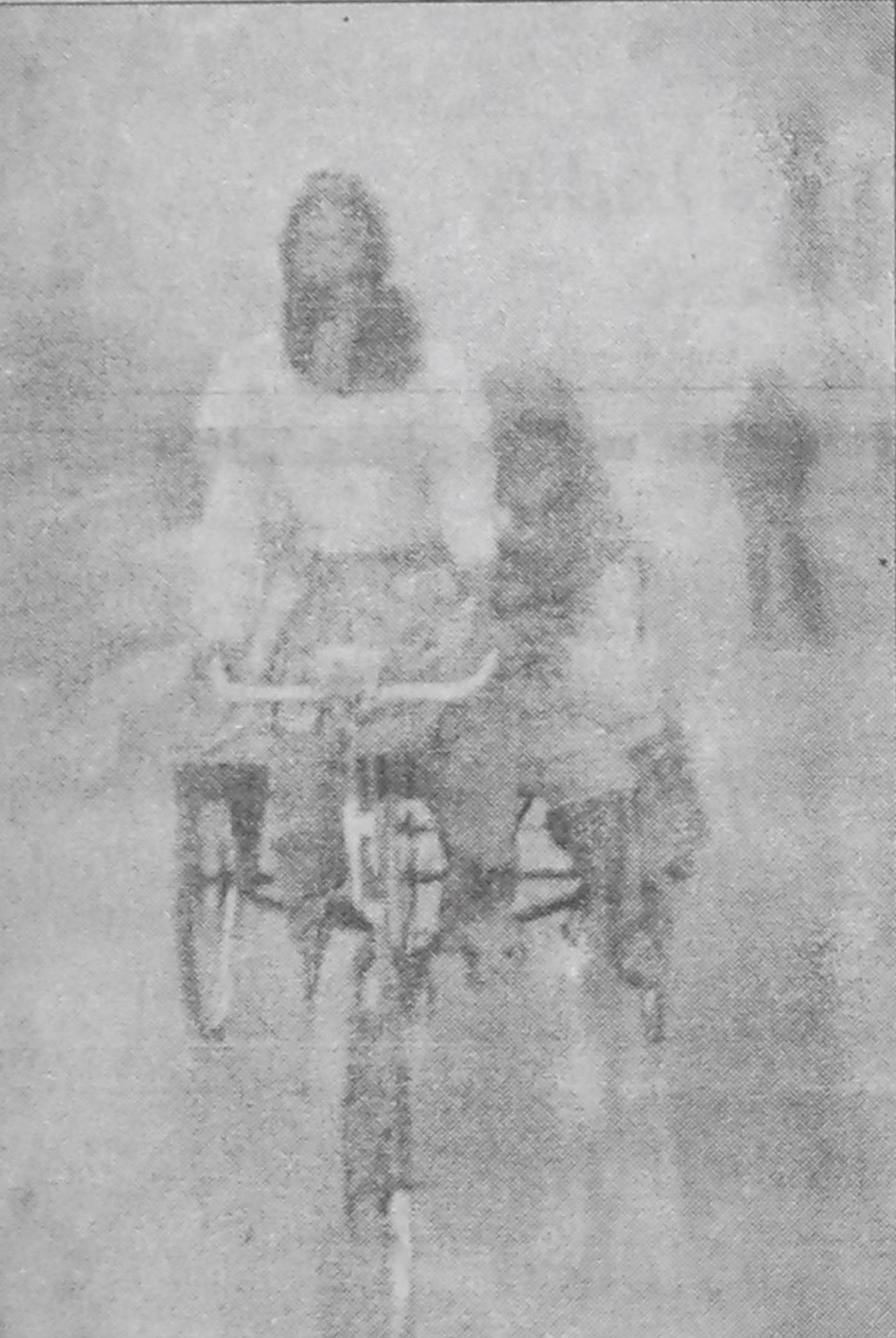
Foggy weather has been prevailing in Jhenidah for the last few days. Photo shows a rickshaw van puller pulling his vehicle along with a passenger risking their lives.