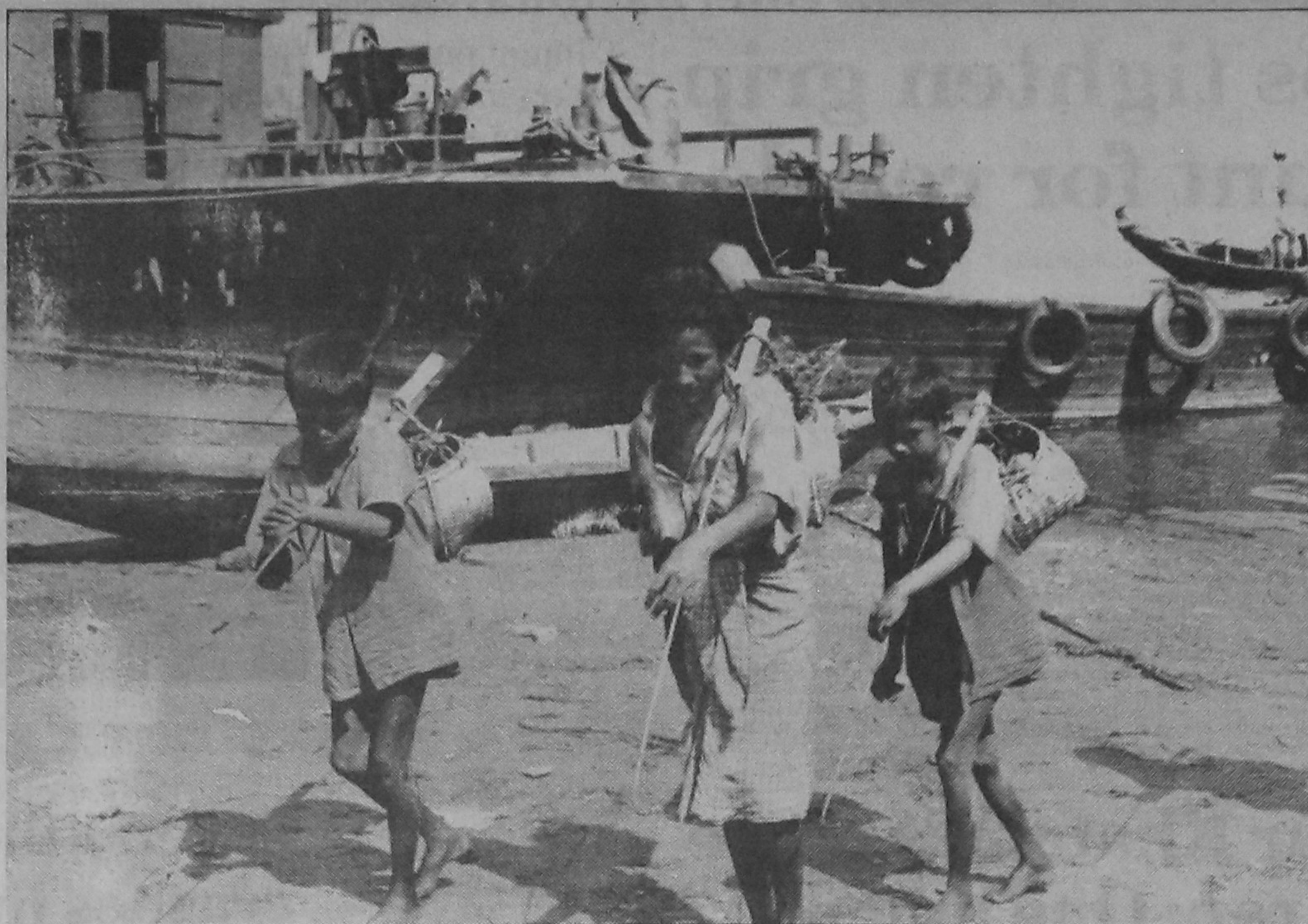
In the coastal areas many people catch crabs to earn living. The boys in the photograph, taken recently in Cox's Bazar, take their catches to markets.

Bridge gas is being supplied to the region. On the other hand, gas could not be supplied also to mechanical problem, causing frequent outage in the northern region. PDB (Power Development Board) is supplying diesel to the plant to produce electricity. PDB will supply diesel to the plant till March 25 under an agreement. The northern region faces outage between 15 megawatt and 20 megawatt during peak hour. Local Agriculture Extension Department officials said irrigation is being hampered in the region because of outage. They said IRR-Boro cultivation on nearly 40 hectares of land in 16 districts under Rajshahi division would face severe hindrance if the problem continues.