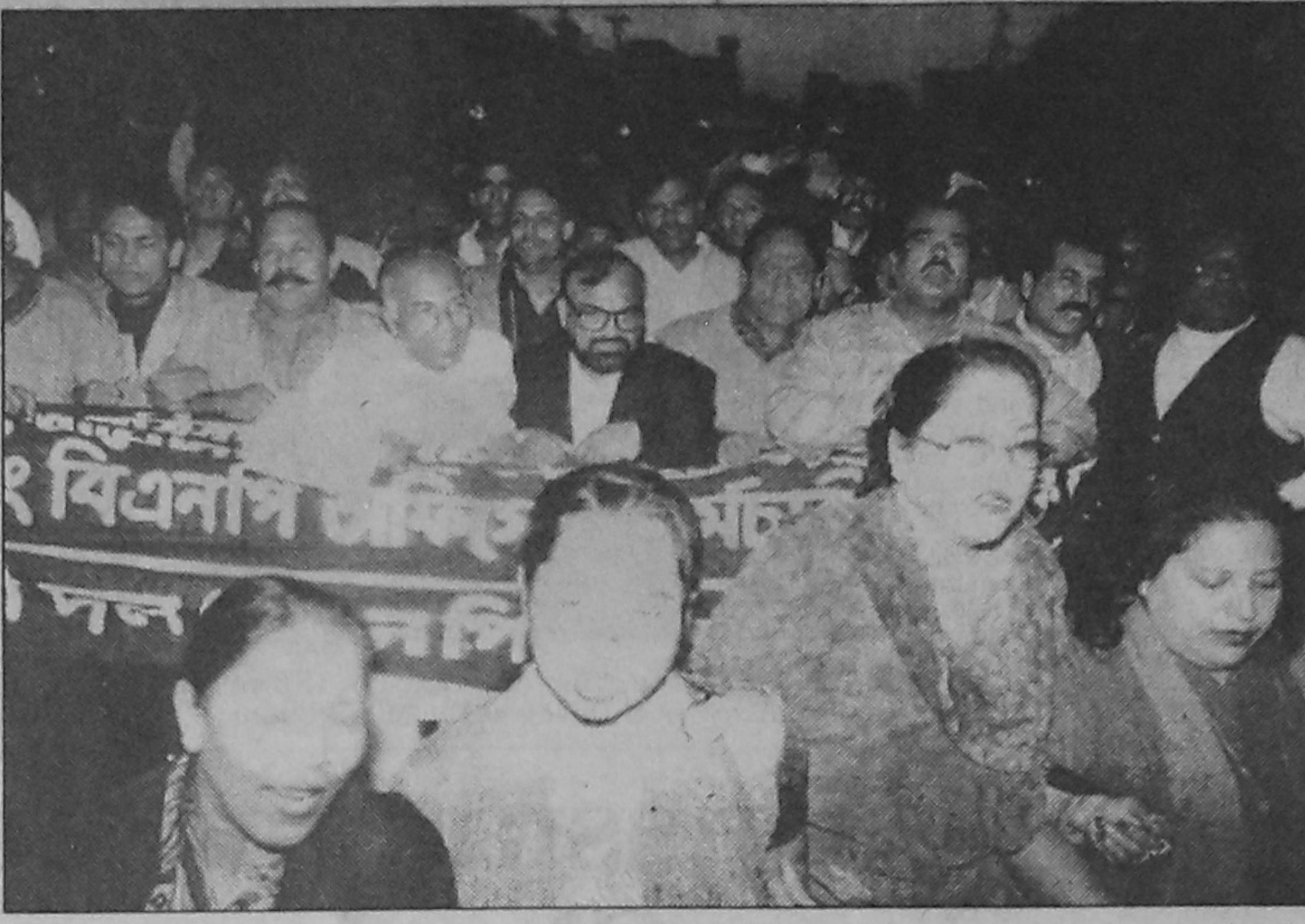
A BNP procession in the city yesterday protesting the Public Safety Act and recent bomb attack at its office.