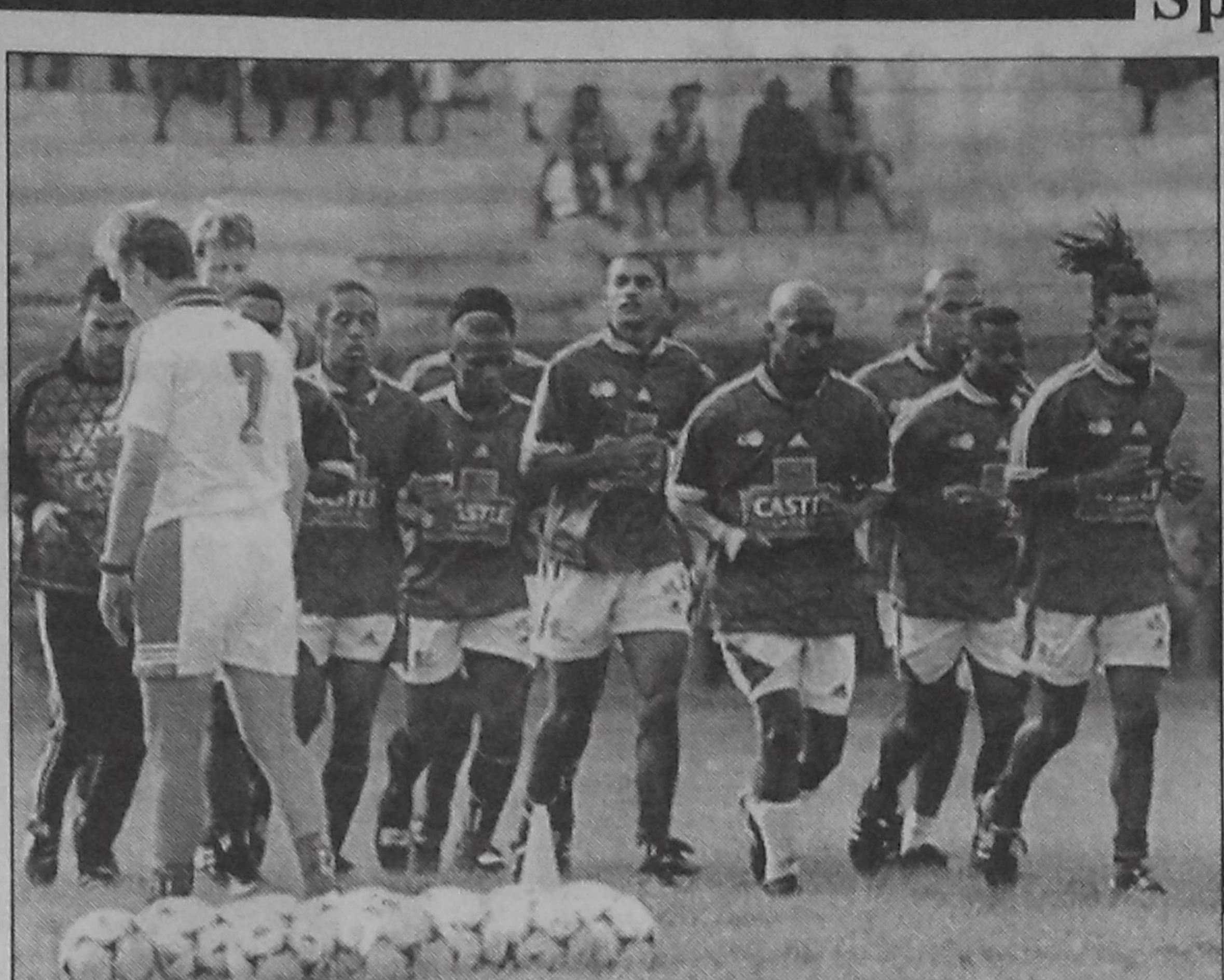
Members of the South African soccer team jog during a practice session at Kumasi on February 3. They meet Ghana in the African Nations' Cup on Sunday.