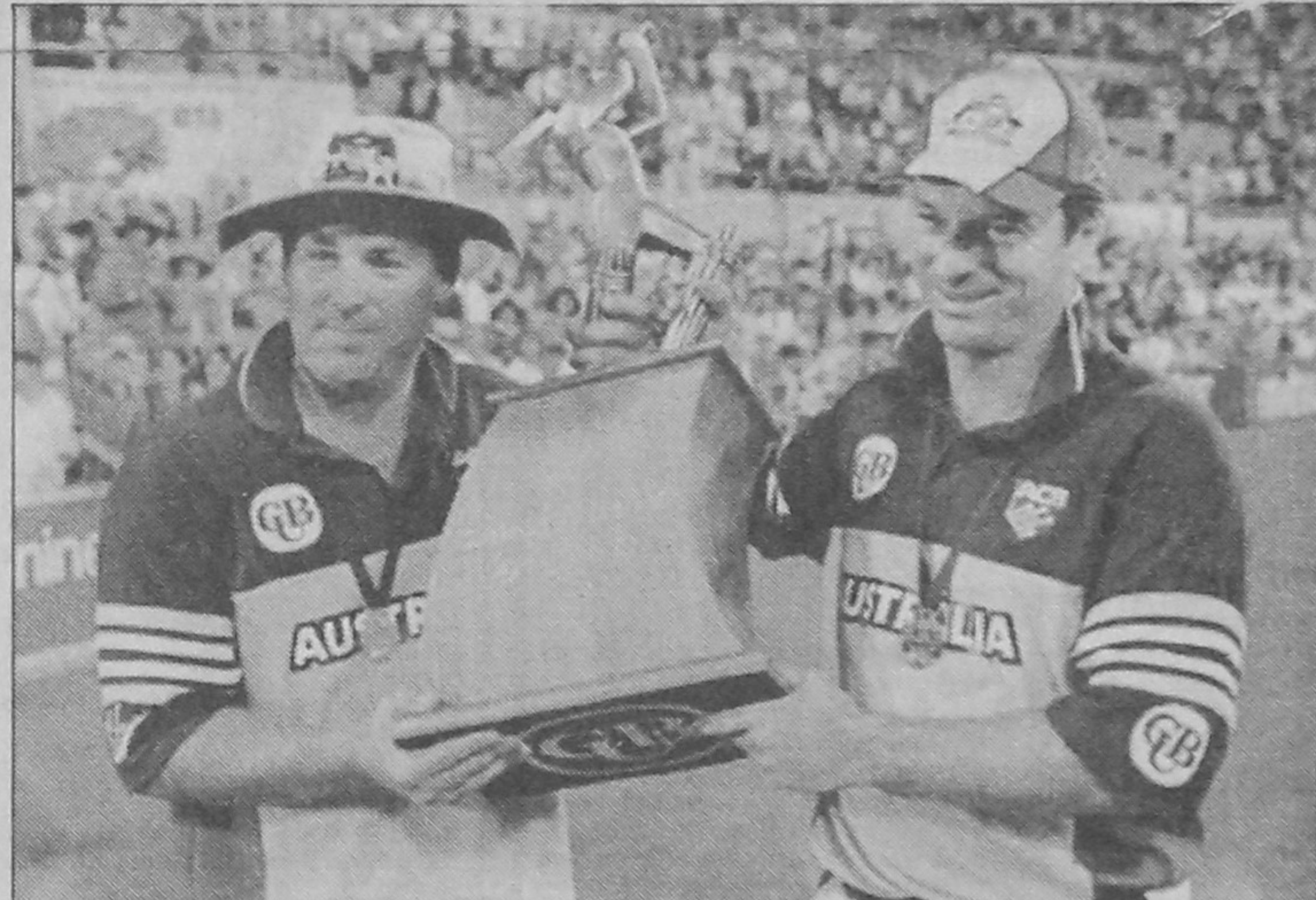
Australian captain Steve Waugh (R) and his deputy Shane Warne hold the Carlton and United tri-series trophy after the second final at the Sydney Cricket Ground yesterday.

Australia won the best-of-three finals 2-0.