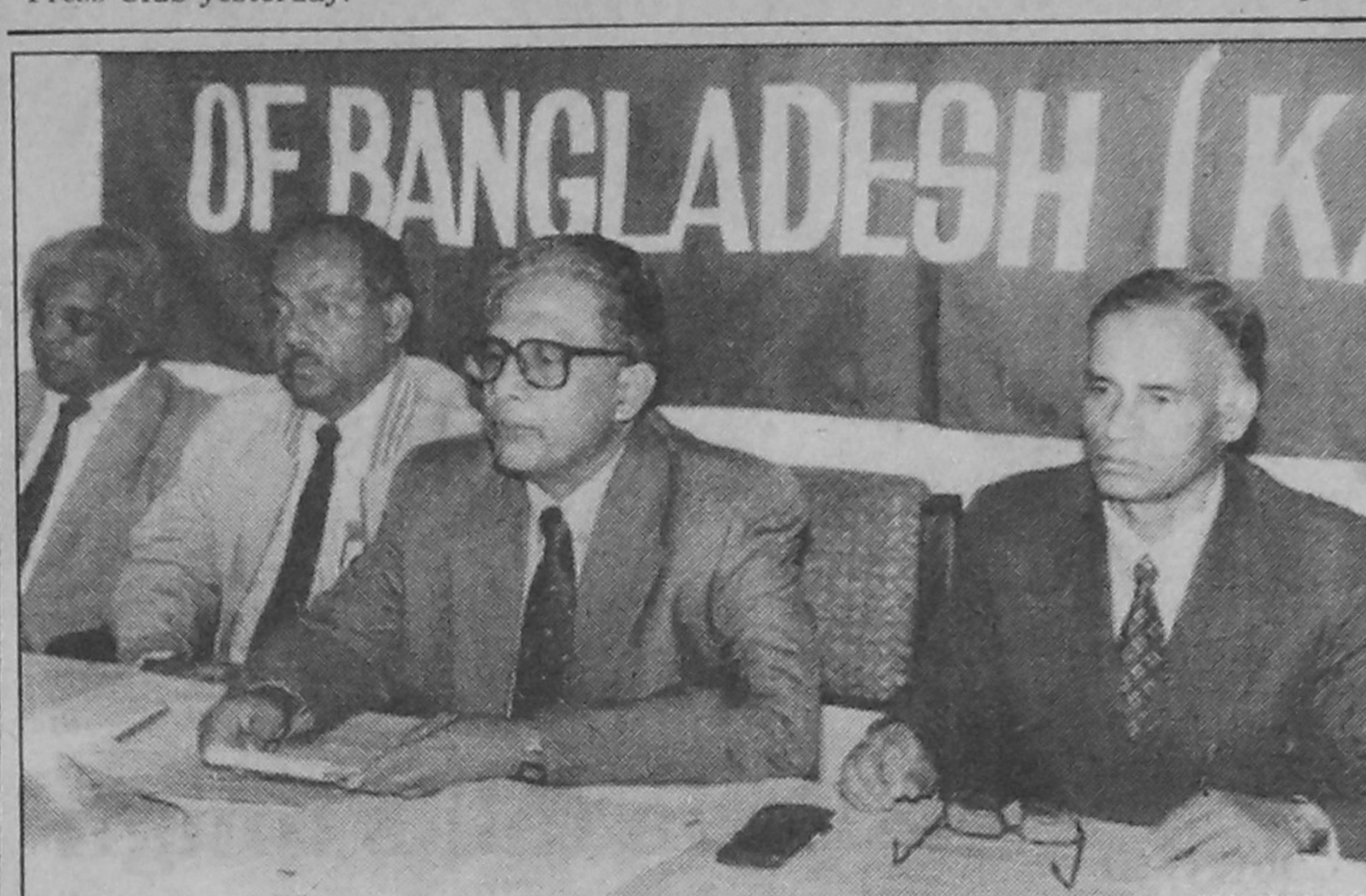
Consumers' Association of Bangladesh (CAB) held a press conference at the Jatiya Press Club in the city yesterday.