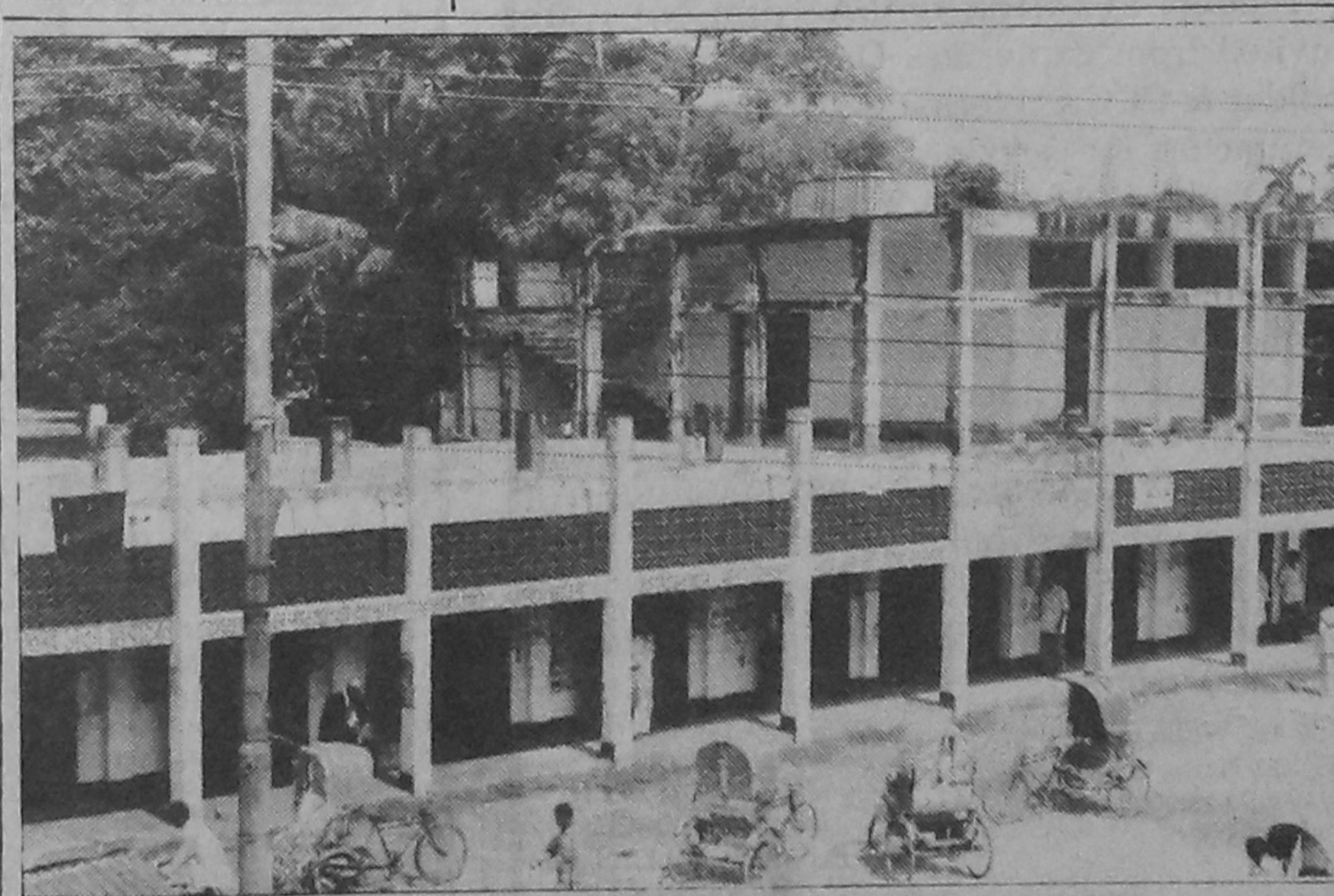
Fund shortage has hampered the work of underconstruction district bar library in Faridpur town.

Last year 31,000 mt of onion were produced by cultivating 3,115 hectares of land in the district.