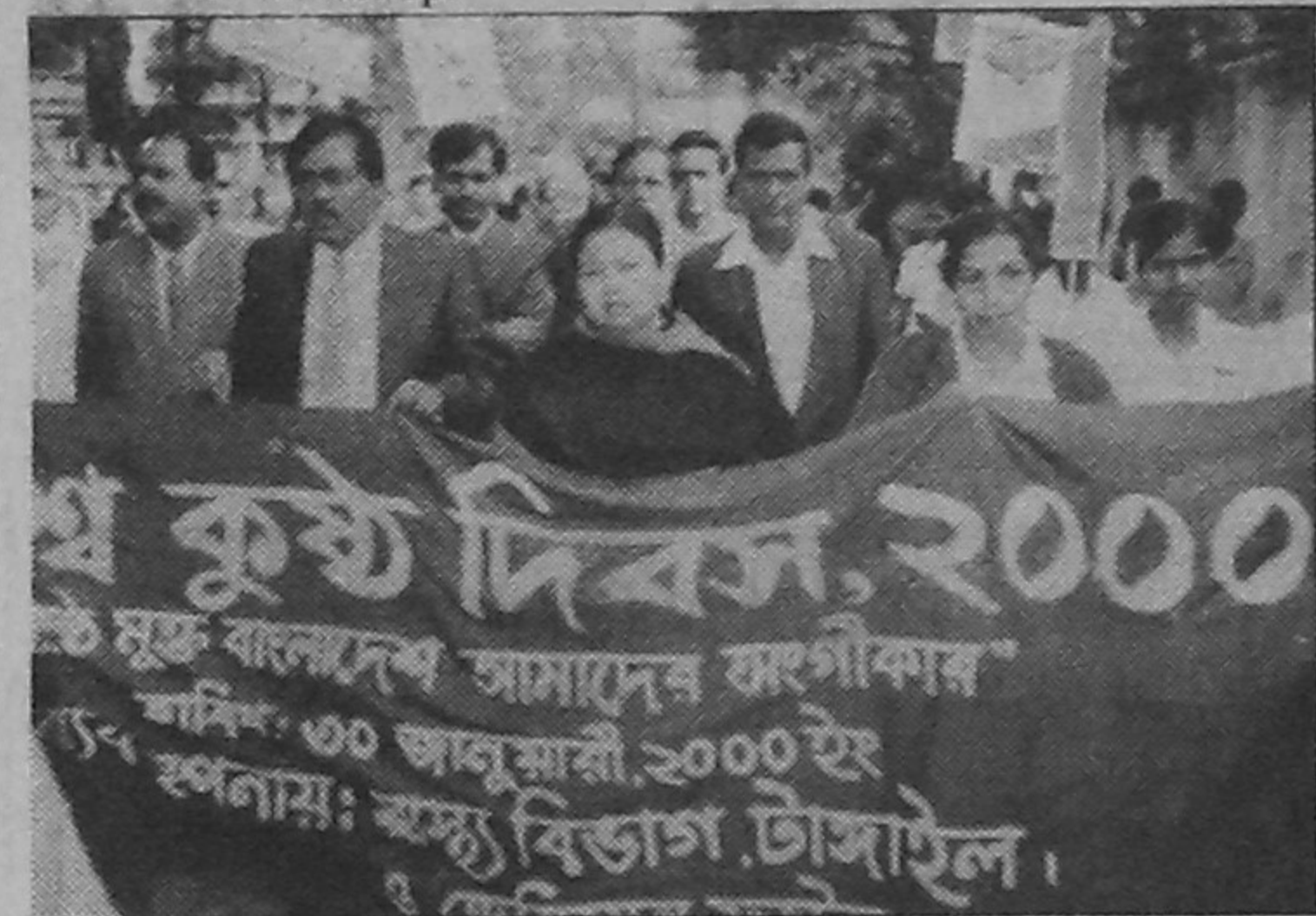
A procession was brought out in Tangail recently to mark the World Leprosy Day.

It was reported that 25 participants including medical professionals from Munshiganj and Narayanganj districts attended the workshop.