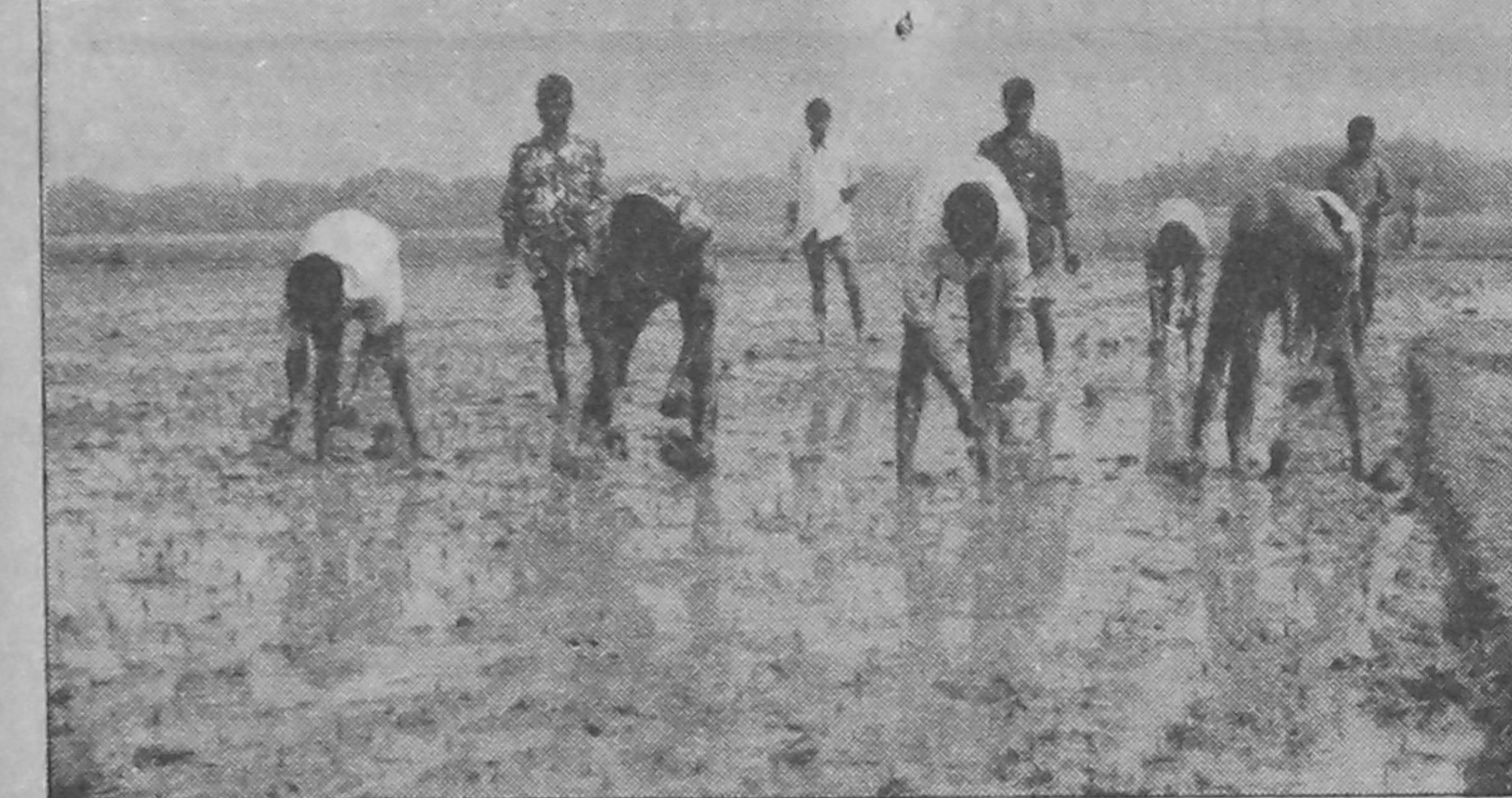
IRRi-Boro cultivation in progress in Jamalpur district.

Officials said some 242 metric tons of wheat worth about Tk 40 lakh has been allocated for implementing the schemes. The projects included construction and reconstruction of kutchra roads and culverts, which are expected to be completed by May next.