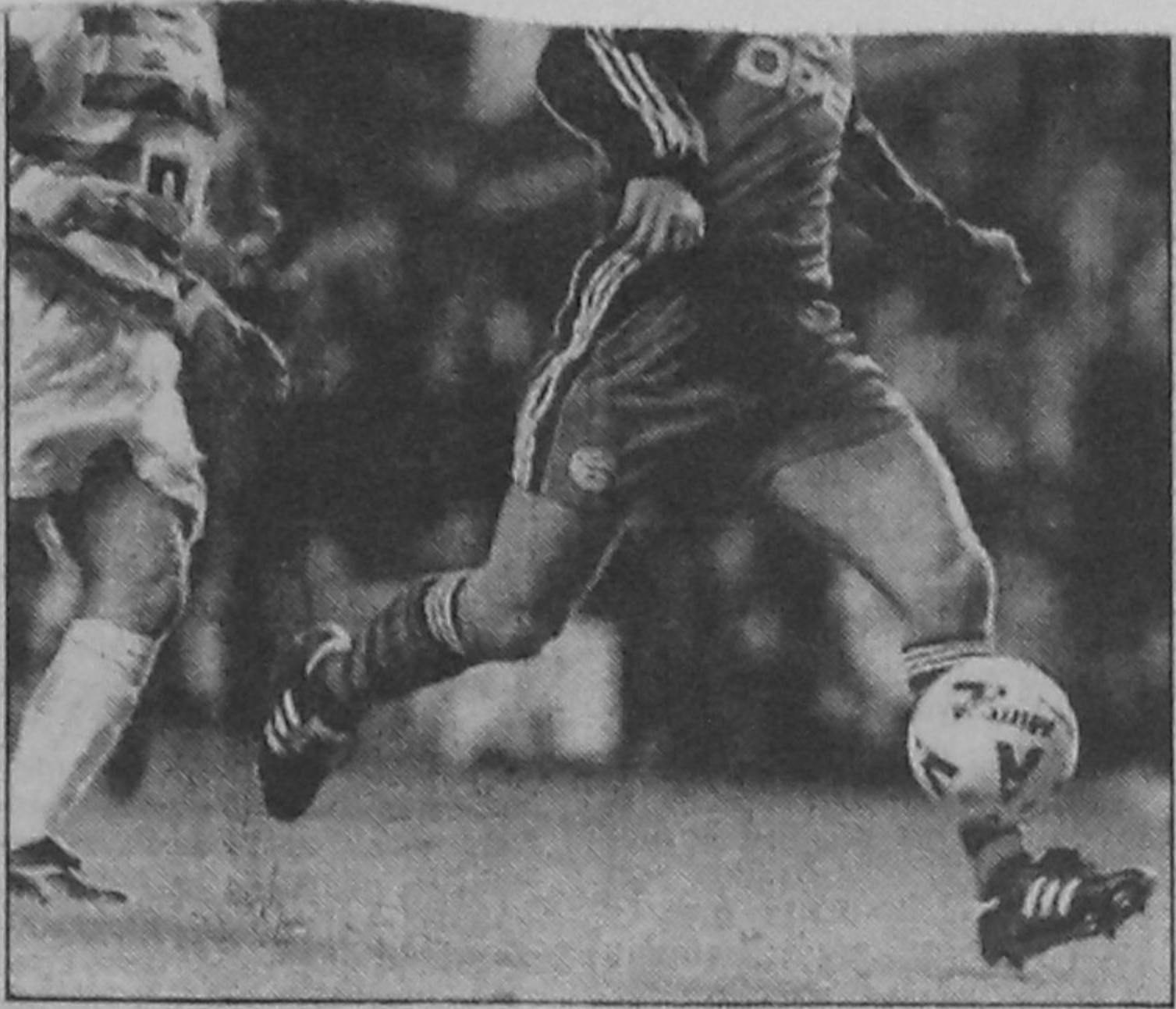
Bayern Munich's Thorsten Fink (R) is about to score a goal against Celtic during a friendly soccer match at Celtic Park in Glasgow on February 1.

FIFA president Sepp Blatter had repeatedly said an African country should host the 2006 tournament as long as it can meet FIFA's standards for hosting the tournament. These involve infrastructure, hotels, telecommunications and security.