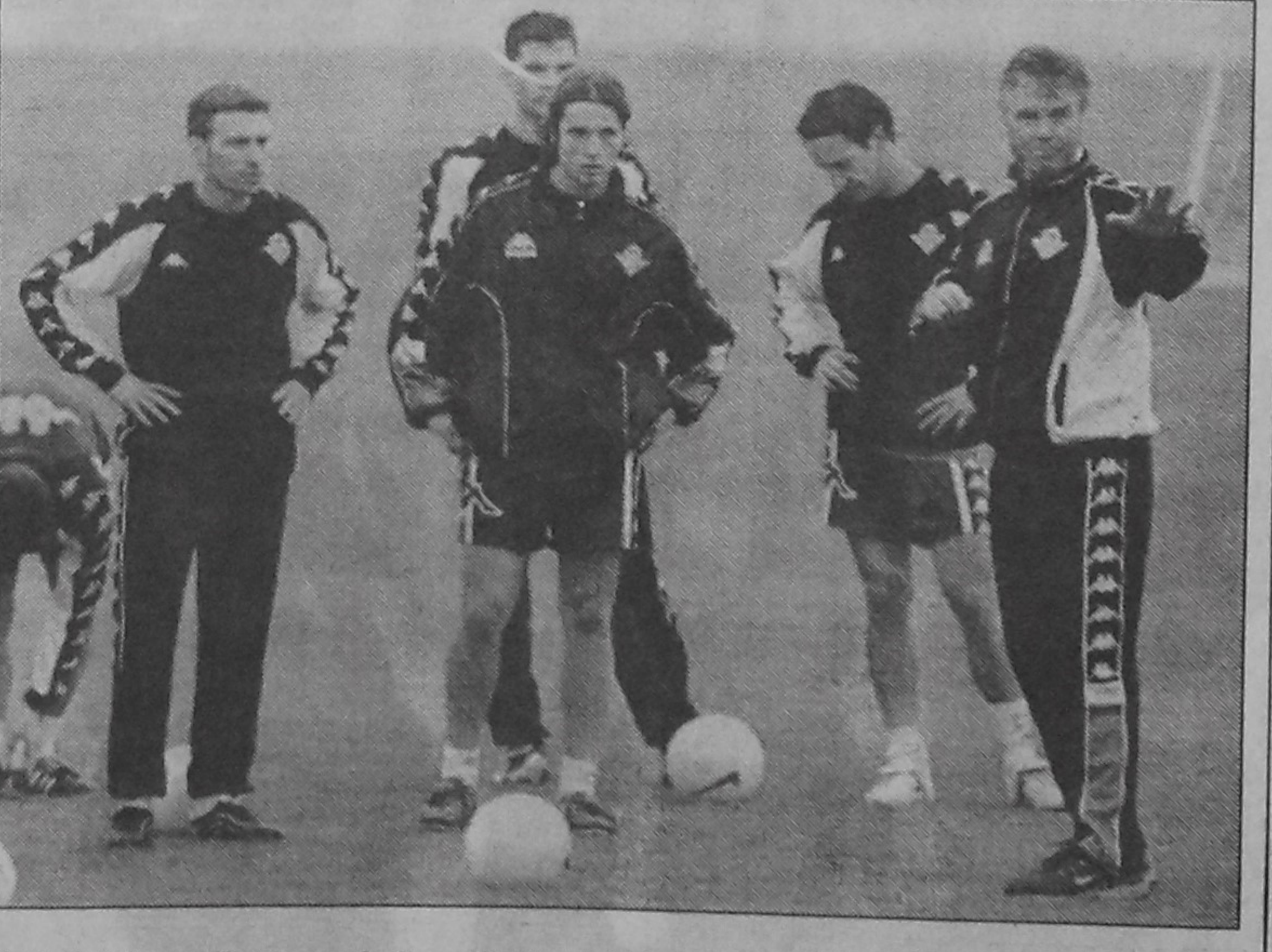
Real Betis' new Dutch coach Guus Hiddink (R) giving instructions to his players during a practice session in Seville on February 1.