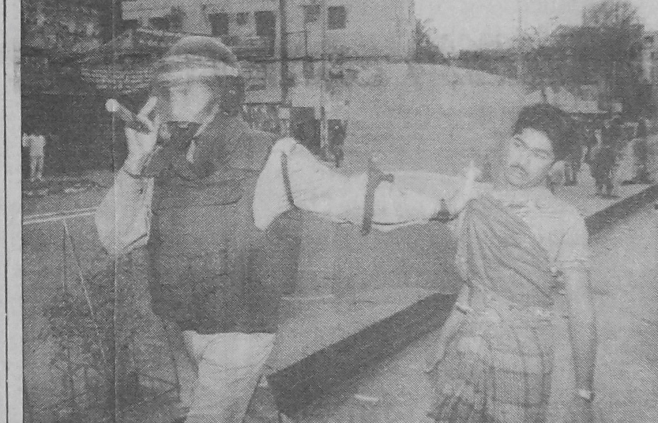
A young man being taken into police yesterday. Police arrested people from the 4-party alliance procession at Bijoy Nagar in the afternoon, for no apparent reason, it was alleged by party activists.

BNP and its allies are out to create anarchy and frustrate the government efforts to implement massive development programmes, they said, adding that Jubo Dal activists were making bombs on the directives of BNP leaders.