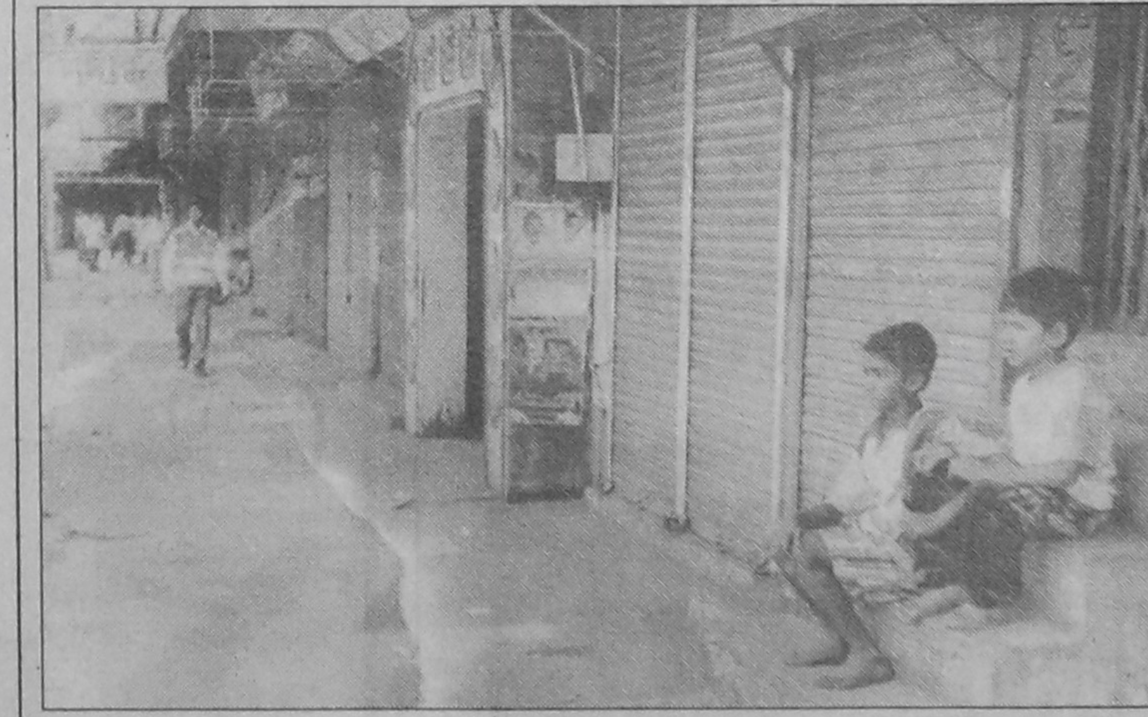
Two children sit on the steps of a closed shop at Bangabandhu Avenue during the hartal hours yesterday. The shops of the market remained closed.