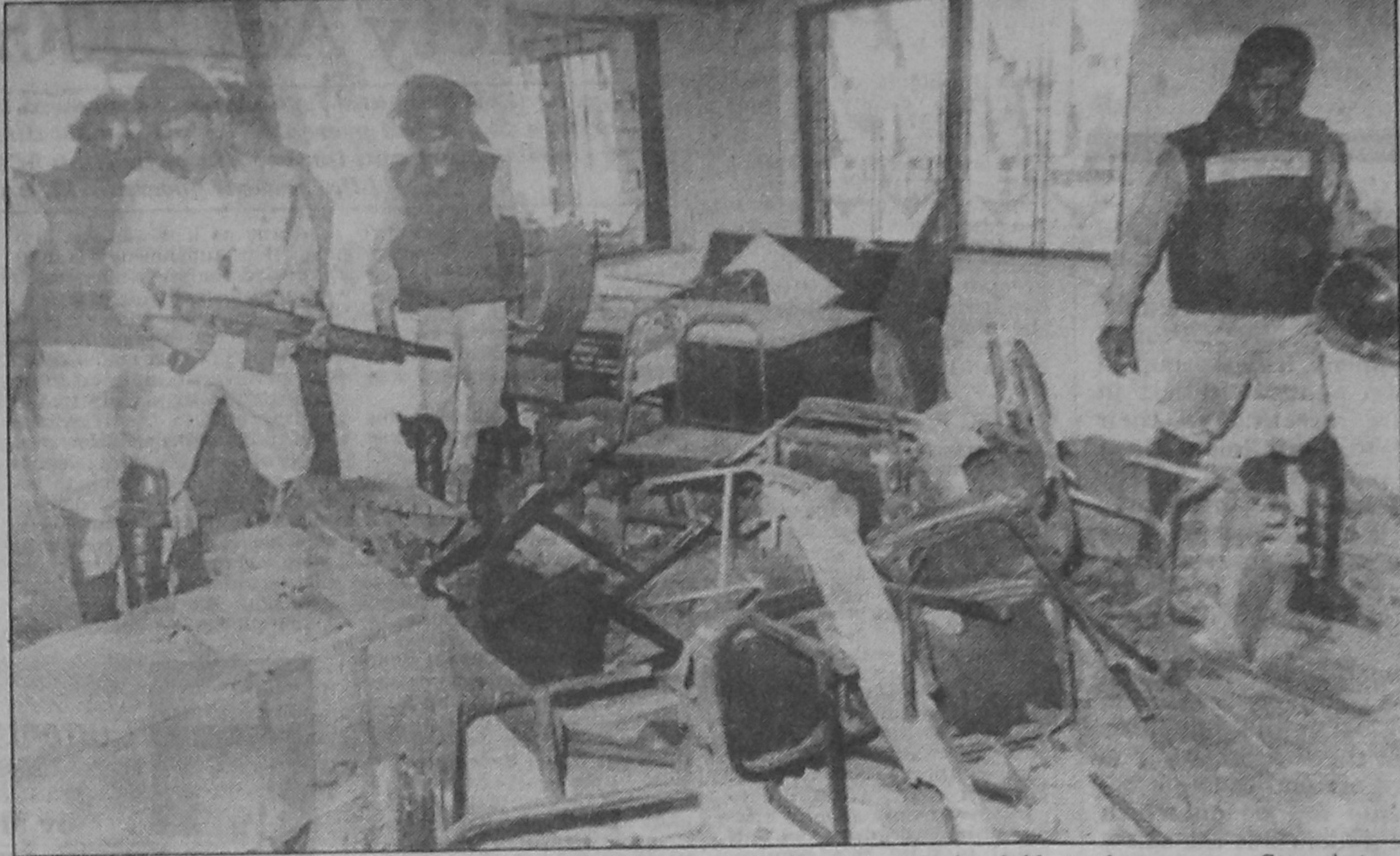
Police inspecting the premises of the BNP's central office at Naya Paltan after the bomb blasts there.

hartal sponsored by the opposition. According to witnesses, this year's festival was less attractive than that of the previous years as lesser number of visitors attended it. Some poets, who were scheduled to attend the festival from the remote areas, could not come due to the hartal, they added. Two sessions for poetry recitation for local and West Bengal poets were held in the afternoon yesterday, on the final day of the festival. Meanwhile, four dramas - Bou, Mukpora, Rangbaaz and Sonar Bangar Puthi - were staged at the Central Shaheed Minar yesterday on the second day of the week-long street drama festival. Bangladesh Grop Theatre Federation organised the festival to celebrate the recognition of Ekushey February as International Mother Language Day. Three more dramas - Chand Mita, Kashaal Khana and Kadamtalir Army Camp - will be staged today.