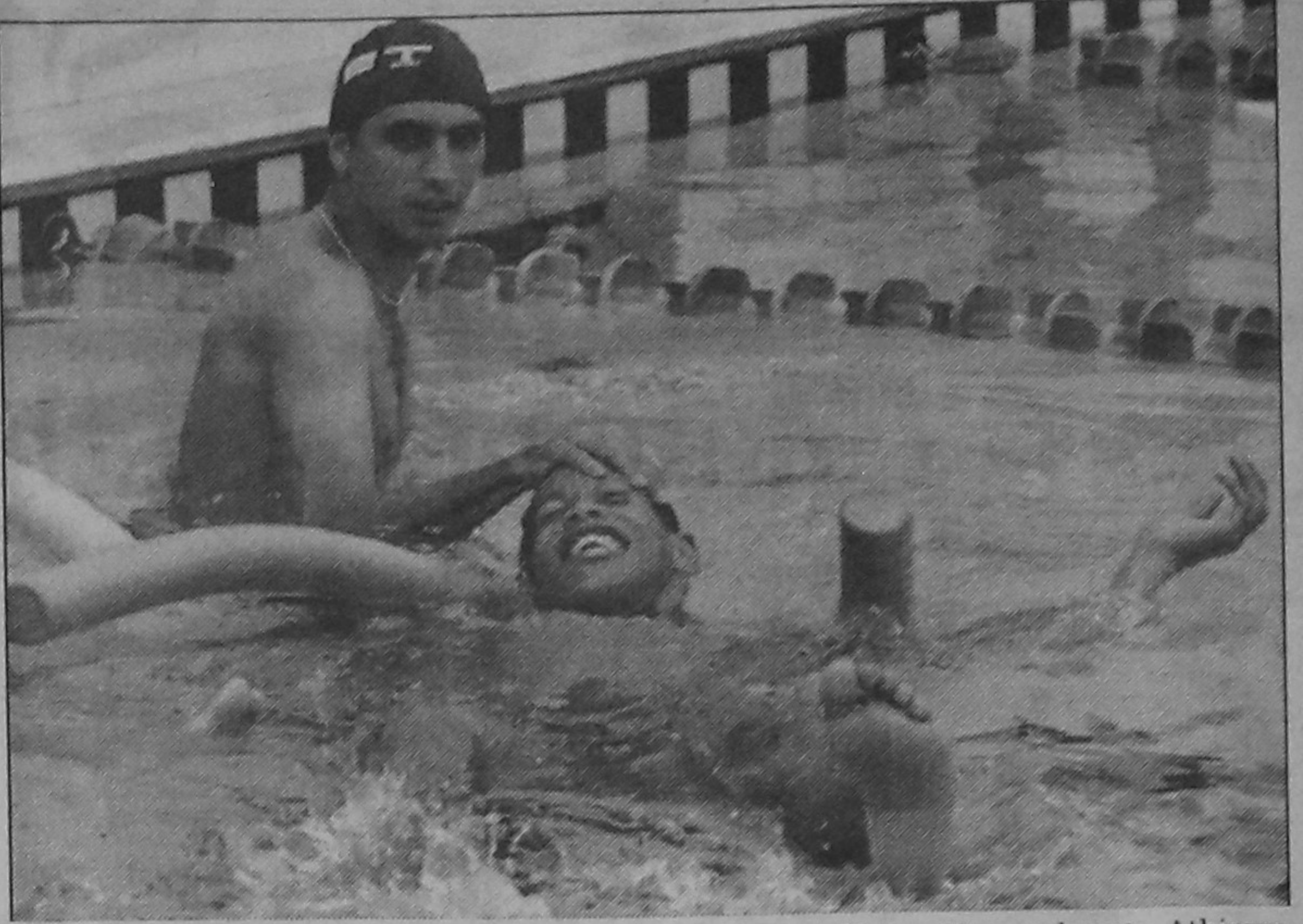
COOLING OFF: Brazilian sensation Ronaldinho (R) and Under-23 squad mate Athirson sharing a light-hearted moment in a swimming pool at Londrina on January 31. Hours earlier, Brazil had routed Colombia 9-0 in a Sydney 2000 Olympics football qualifying match.