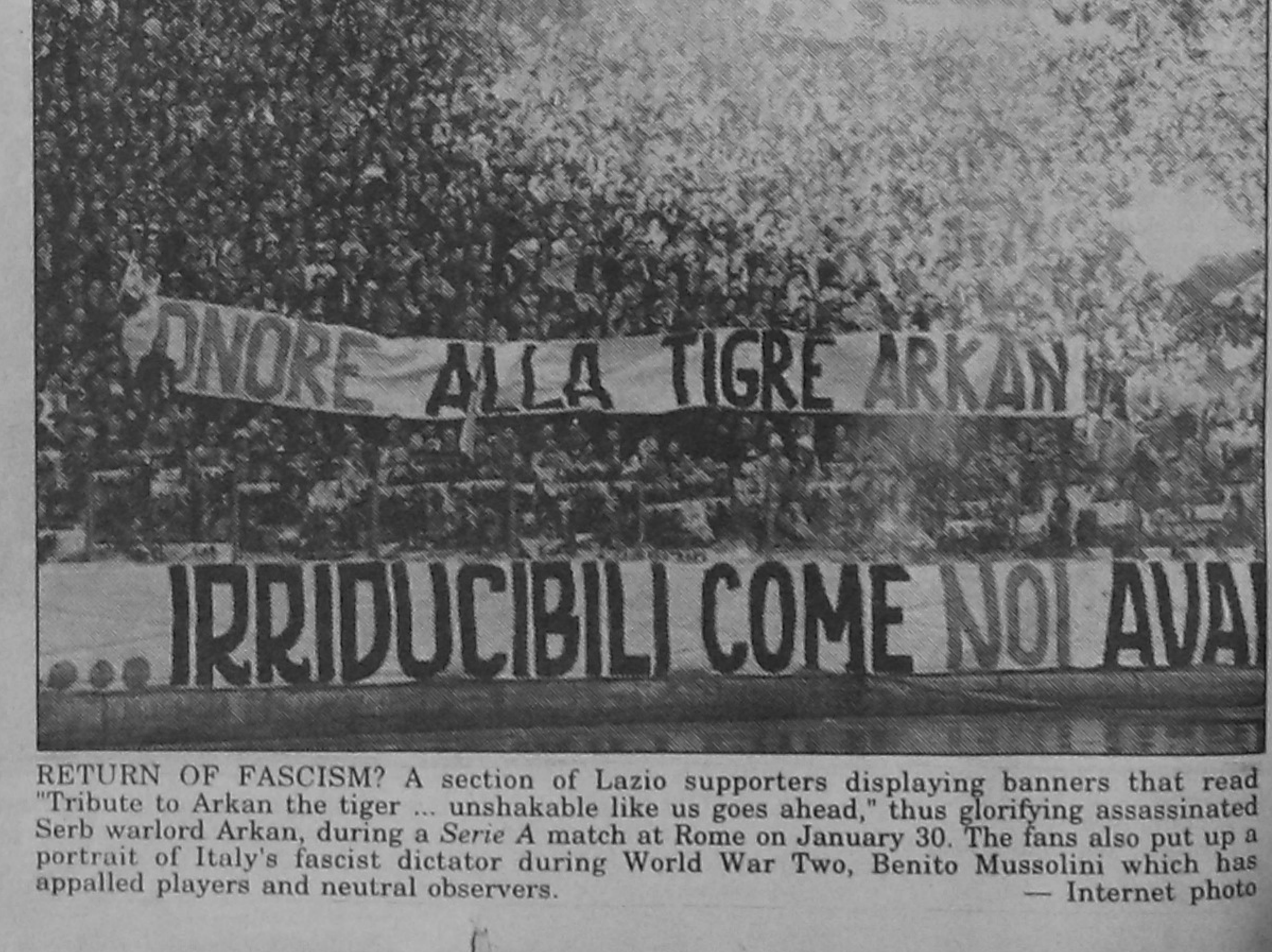
RETURN OF FASCISM? A section of Lazio supporters displaying banners that read "Tribute to Arkan the tiger... unshakable like us goes ahead, thus glorifying assassinated Serb warlord Arkan, during a Serie A match at Rome on January 30. The fans also put up a portrait of Italy's fascist dictator during World War Two, Benito Mussolini which has appalled players and neutral observers.