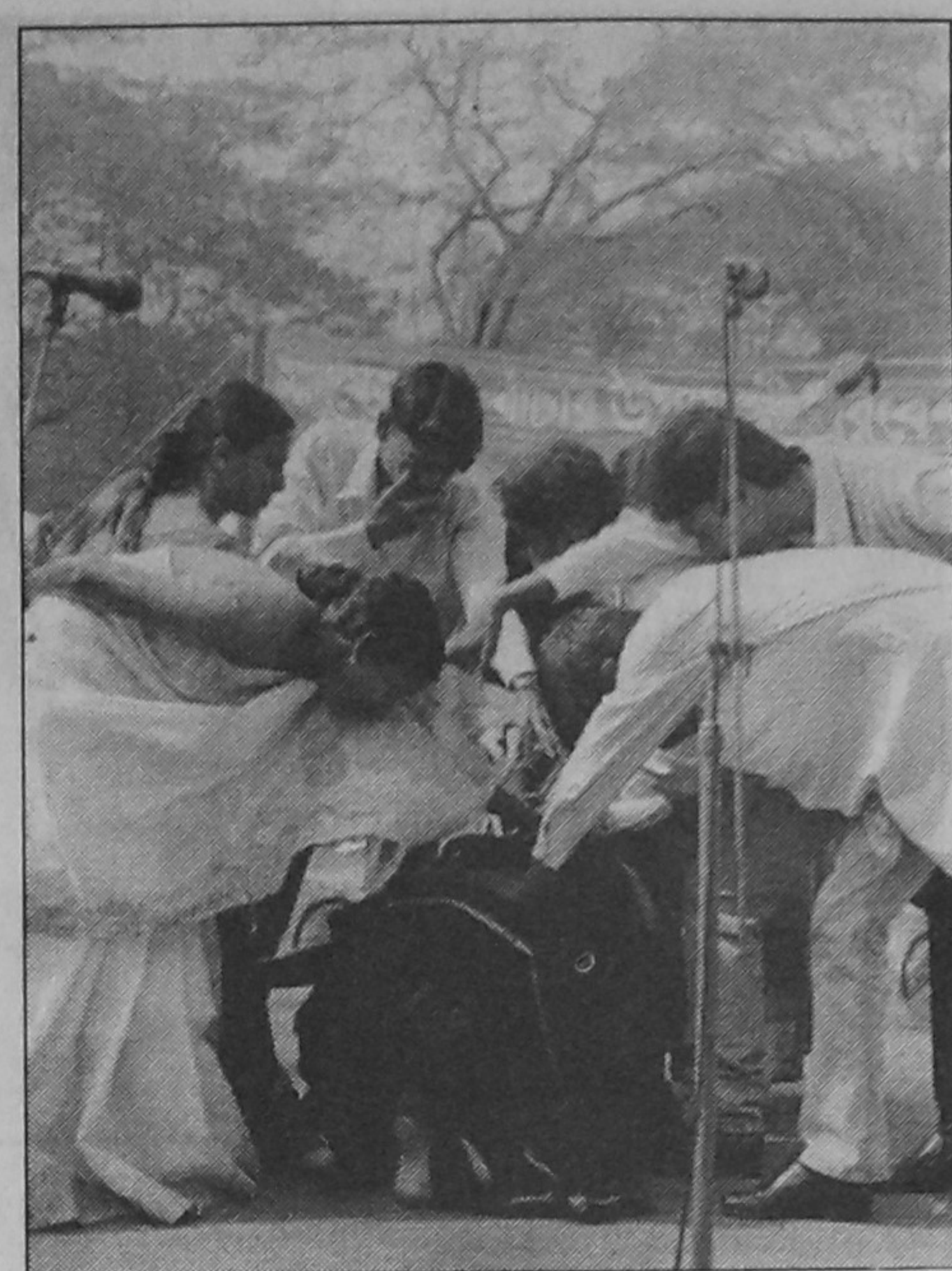
A sequence from a street drama organised by Nari Progati Sangha (BNPS) on DU campus yesterday. The organisation is holding a series of such dramas on street corners to raise public awareness about repression of women and other terrorism in the country.

A total of 32 theatre groups from across the country are taking part in the festival.