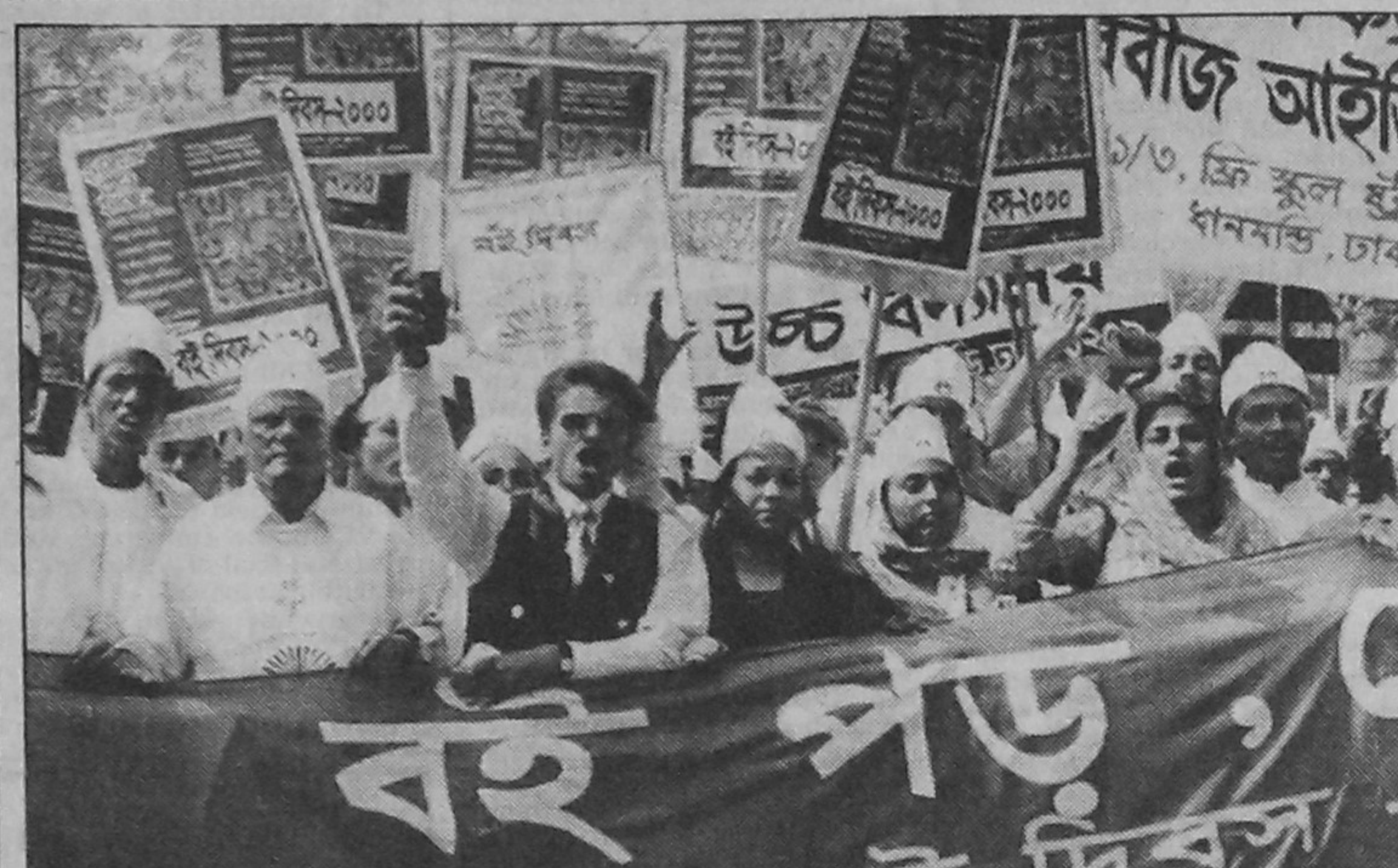
A rare rally members of the Bangladesh Book Club brought out a procession from the Central Shaheed Minar yesterday on the occasion of the National Book Day.