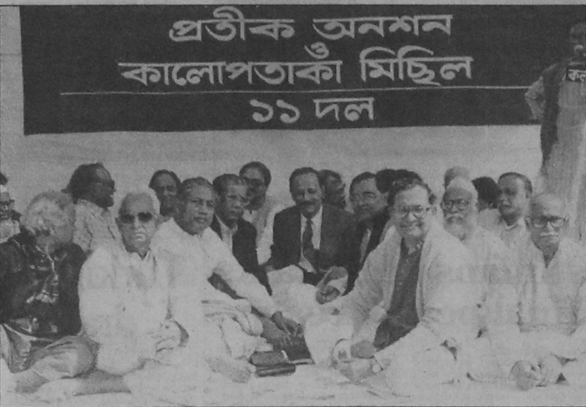
The 11-party alliance observed a token hunger strike at Muktangan in the city yesterday protesting passage of Public Safety Bill in parliament.