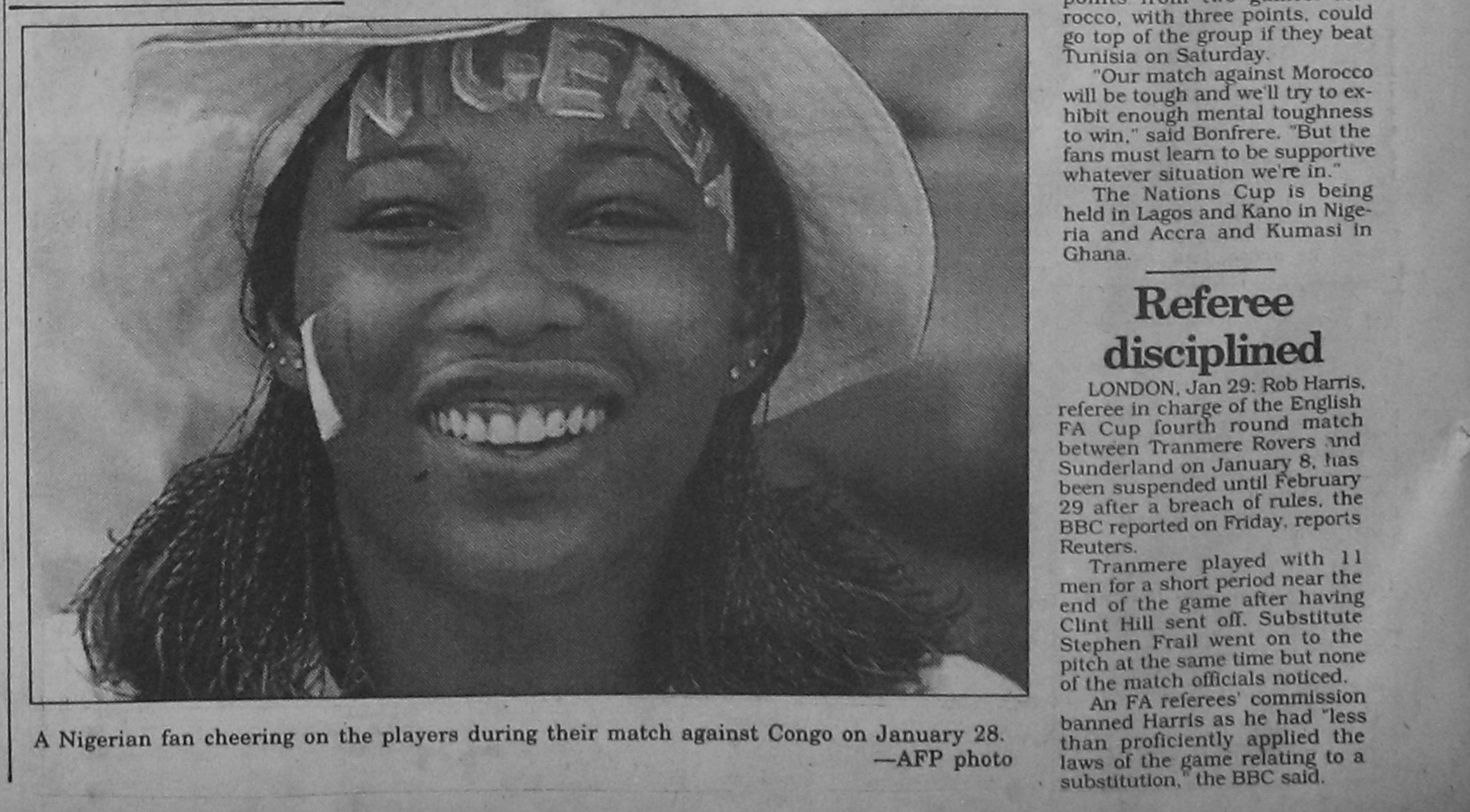
A Nigerian fan cheering on the players during their match against Congo on January 28.