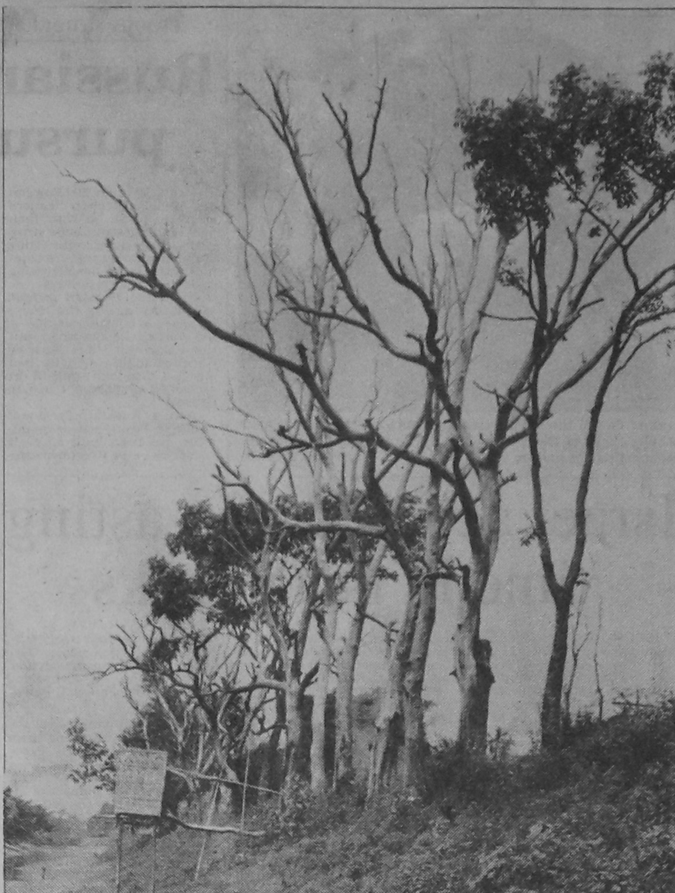
The onslaught : This is what the great deluge of 1998 left behind on the Dhaka-Sylhet road. According to an estimate by the Roads and Highways officials, more than 6,000 such trees have seen their demise following the prolonged flooding. To the delight of thieves, bureaucratic complications have not enabled the authorities to remove the dead trees and earn something for the exchequer. The fuel wood fetches up to Tk 100 per maund (about 38 kg) in the local markets.