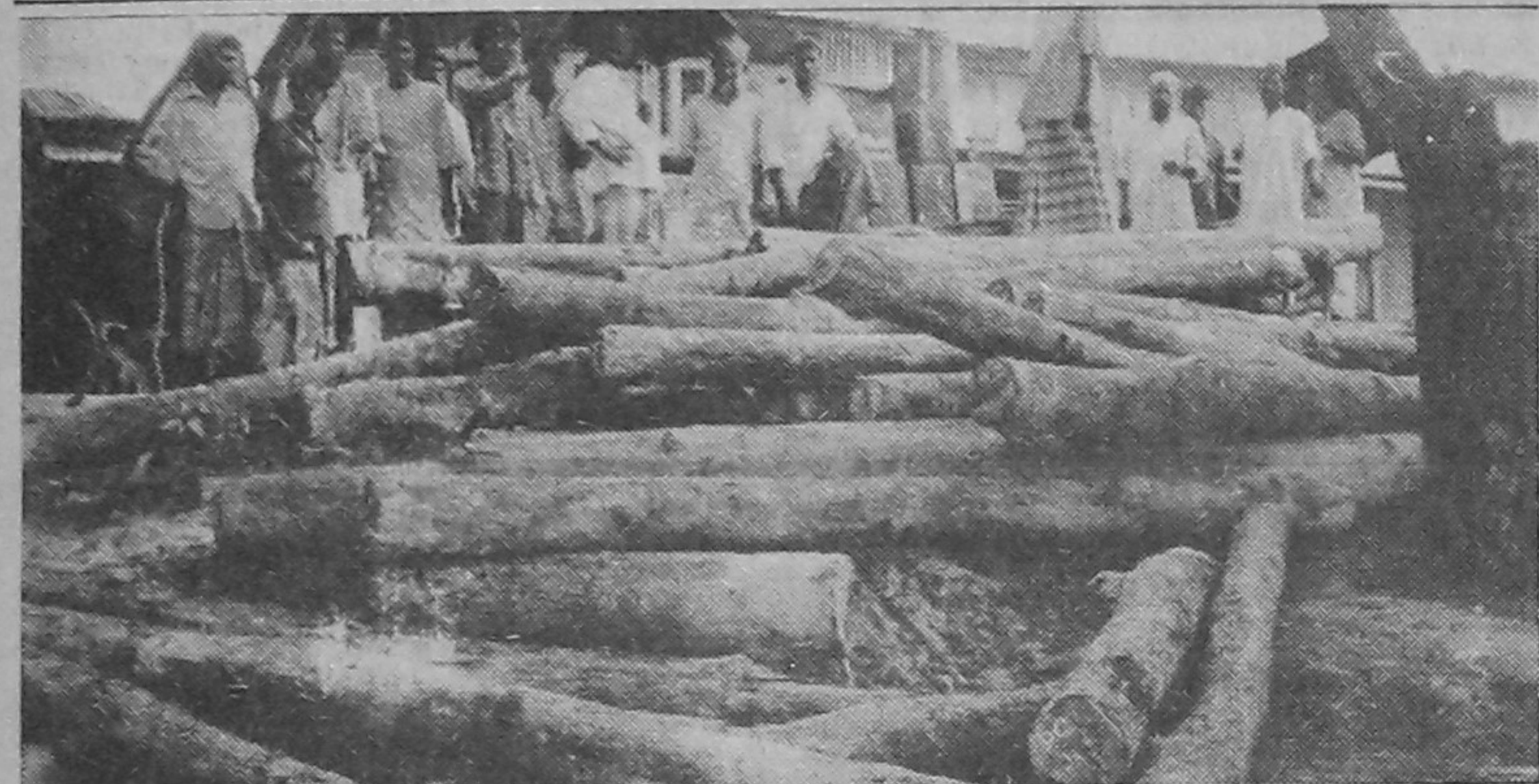
People of Latchapali union under Kalapara thana in Patuakhali district caught recently a huge quantity of illegally smuggled Keora timbers brought from Khajura forest.