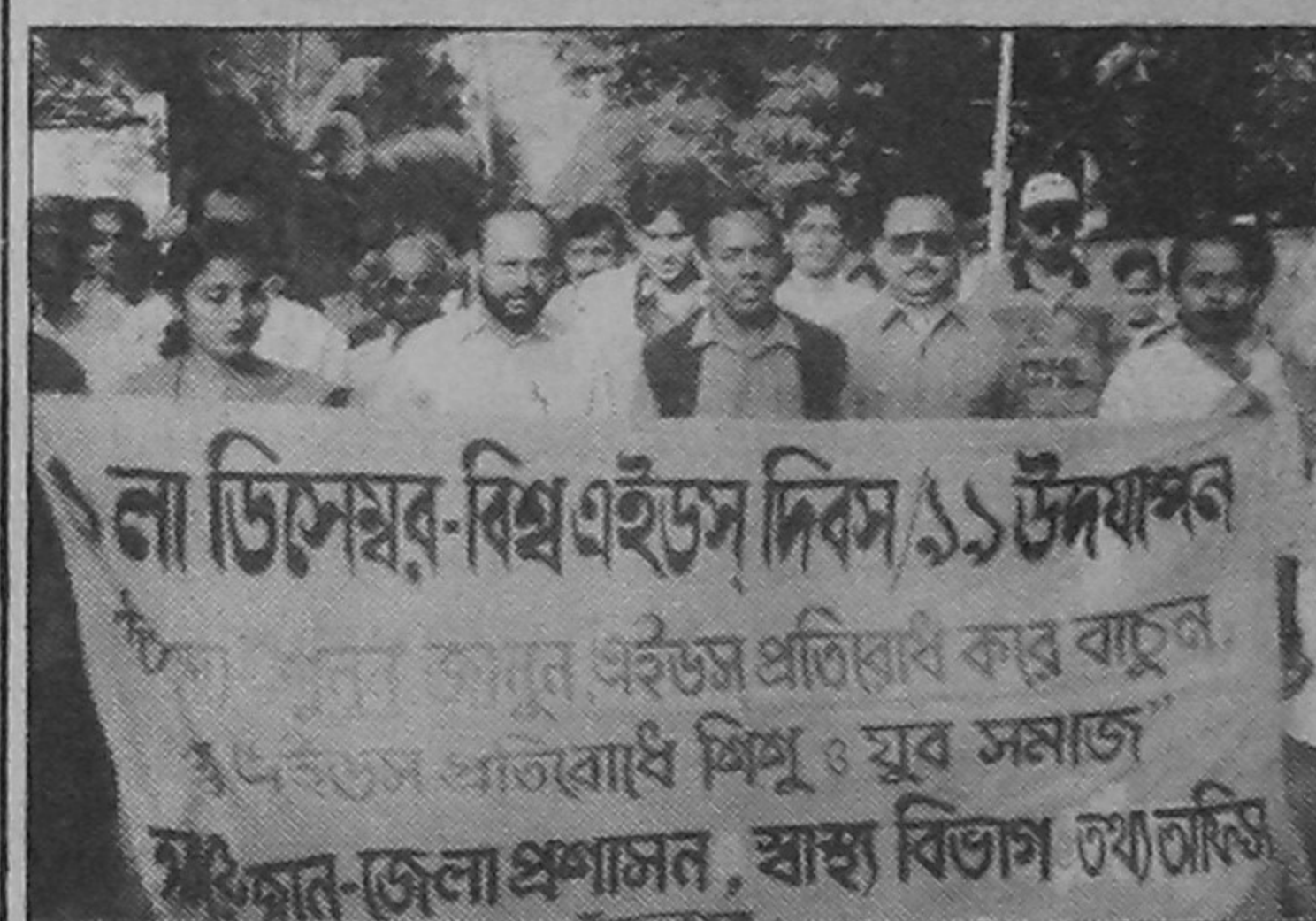
A procession was brought out in Chandpur town last month by the local district administration in cooperation with the Health Department on the occasion of World Aids Day.