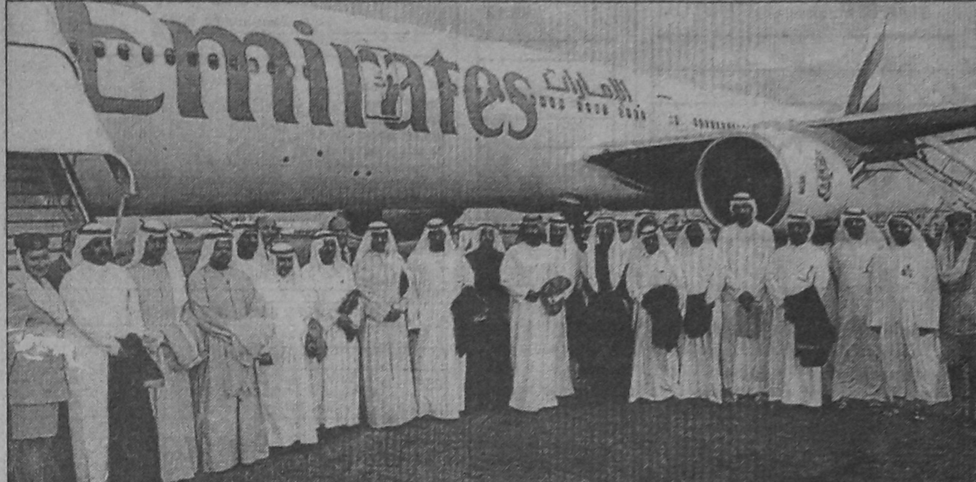
Sheikh Ahmed bin Saeed Al Maktoum, Emirates' Chairman, leads a VIP Dubai delegation to Bahrain on Emirates' inaugural flight.