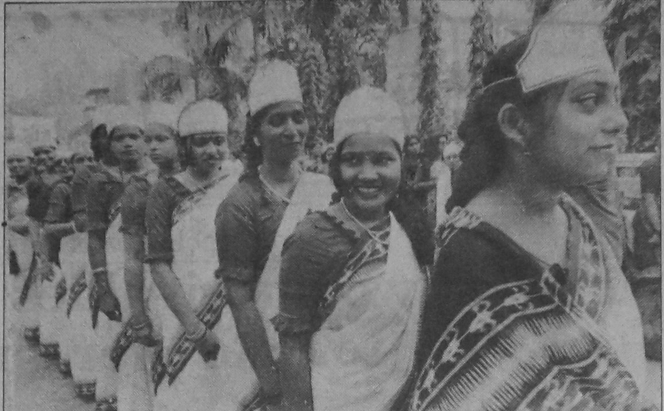
Rabindra Sangeet Shilpi Sangstha brought out a colourful procession in the city yesterday to mark the 11th National Rabindra Sangeet Festival.