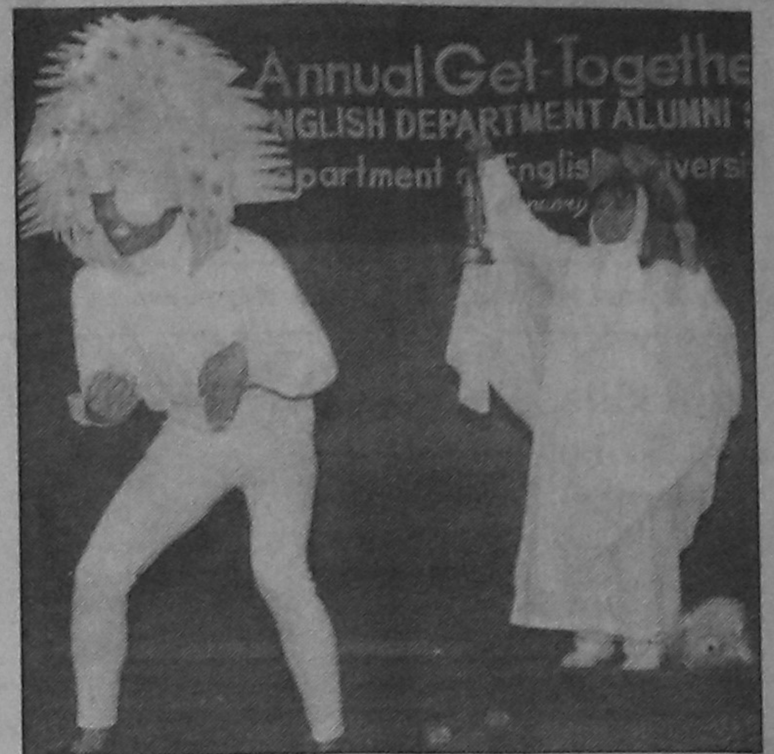
The Dhaka University English Department Drama Society presents a scene from Shakespeare's 'A Midsummer Night's Dream' at the annual get-together of the English Department Alumni Society. The event was held at TSC auditorium on the campus yesterday.

The get-together re-elected the incumbent executive committee and decided to extend its tenure to two years.