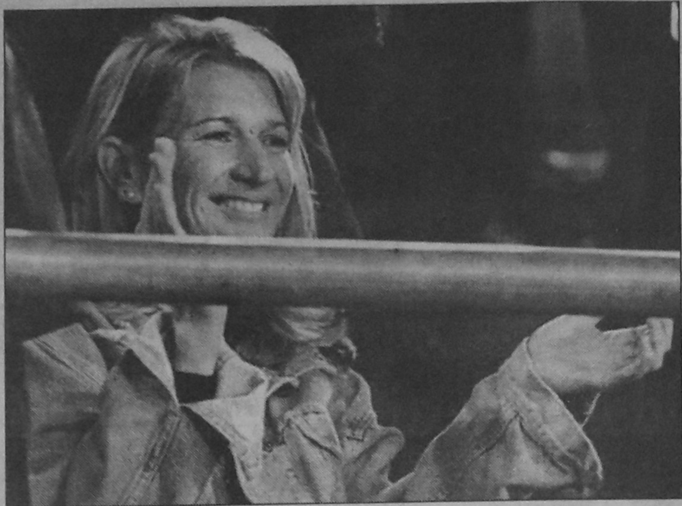
Former world number one Steffi Graf applauds during her boyfriend Andre Agassi's semifinal victory over fellow American Pete Sampras at the Australian Open yesterday.