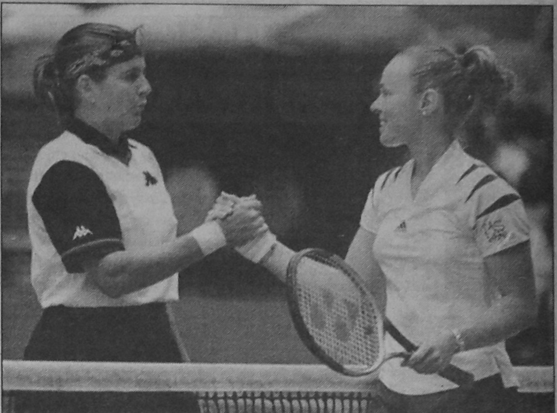
Spanish Conchita Martinez (L) congratulates her Australian Open semifinal counterpart Martina Hingis after losing the match by straight sets yesterday.

The 23-year-old is a slowly reconstructing her career after a much-publicised off-court rebellion in 1993 which culminated in arrests for marijuana possession and shoplifting.