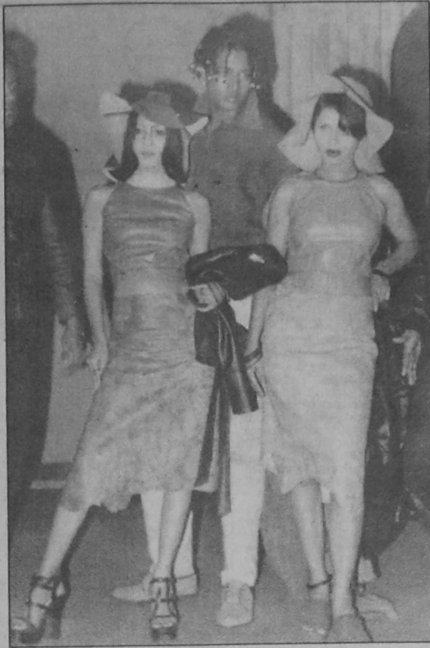
Model Watch presents a fashion show at Sonargaon Hotel in the city. The event was held yesterday as part of Dhaka International Leather Fair 2000.

She was first taken to a local hospital and succumbed to her injuries on way to Dhaka.