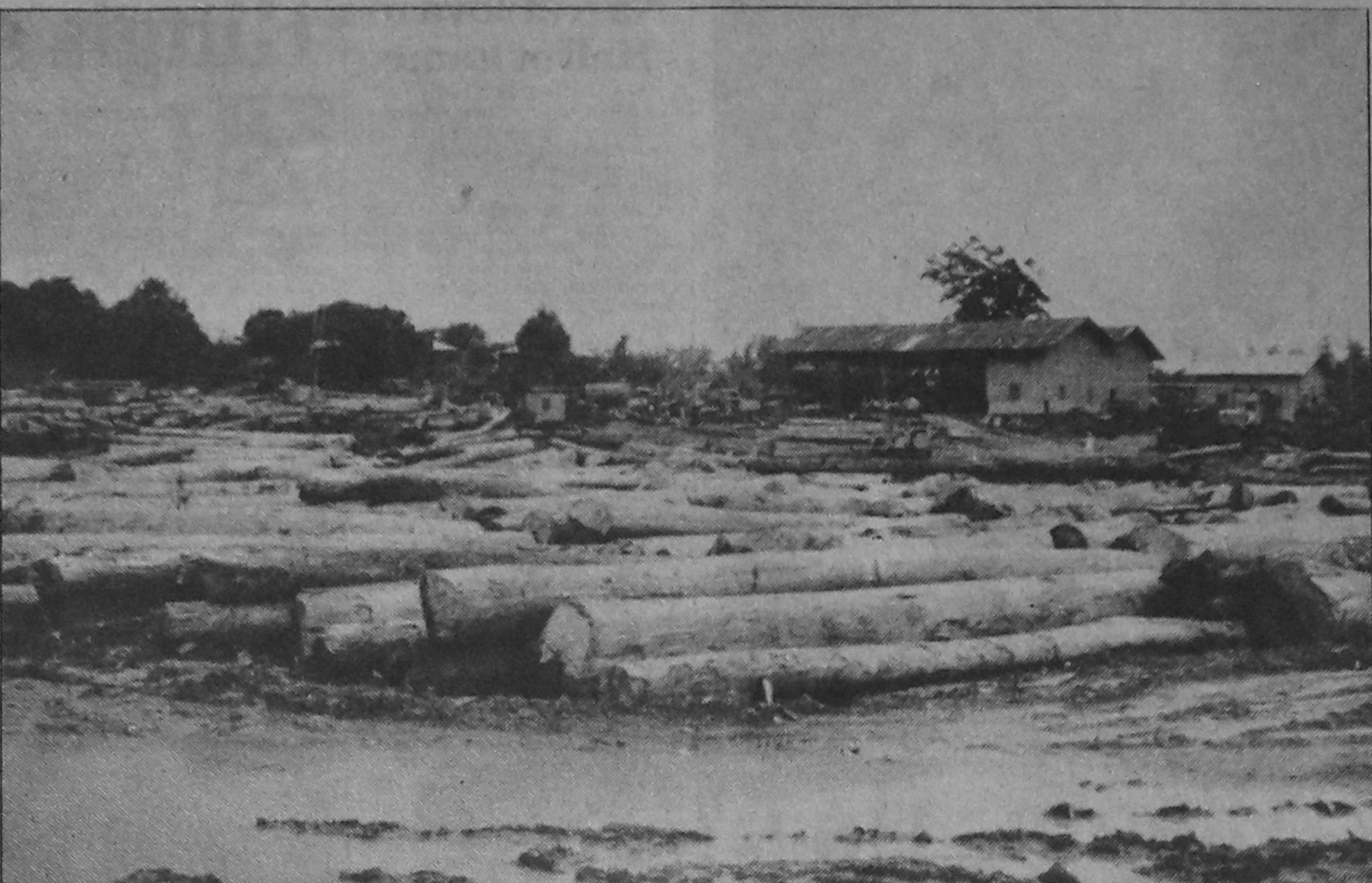
When will it stop? Illegal logging is rampant throughout the country. At many places like Chittagong Hill Tracts influential section of people are joined by cash-hardened farmers to chop down valuable trees. The practice is almost unhampered as it also generates cash for the law enforcers.