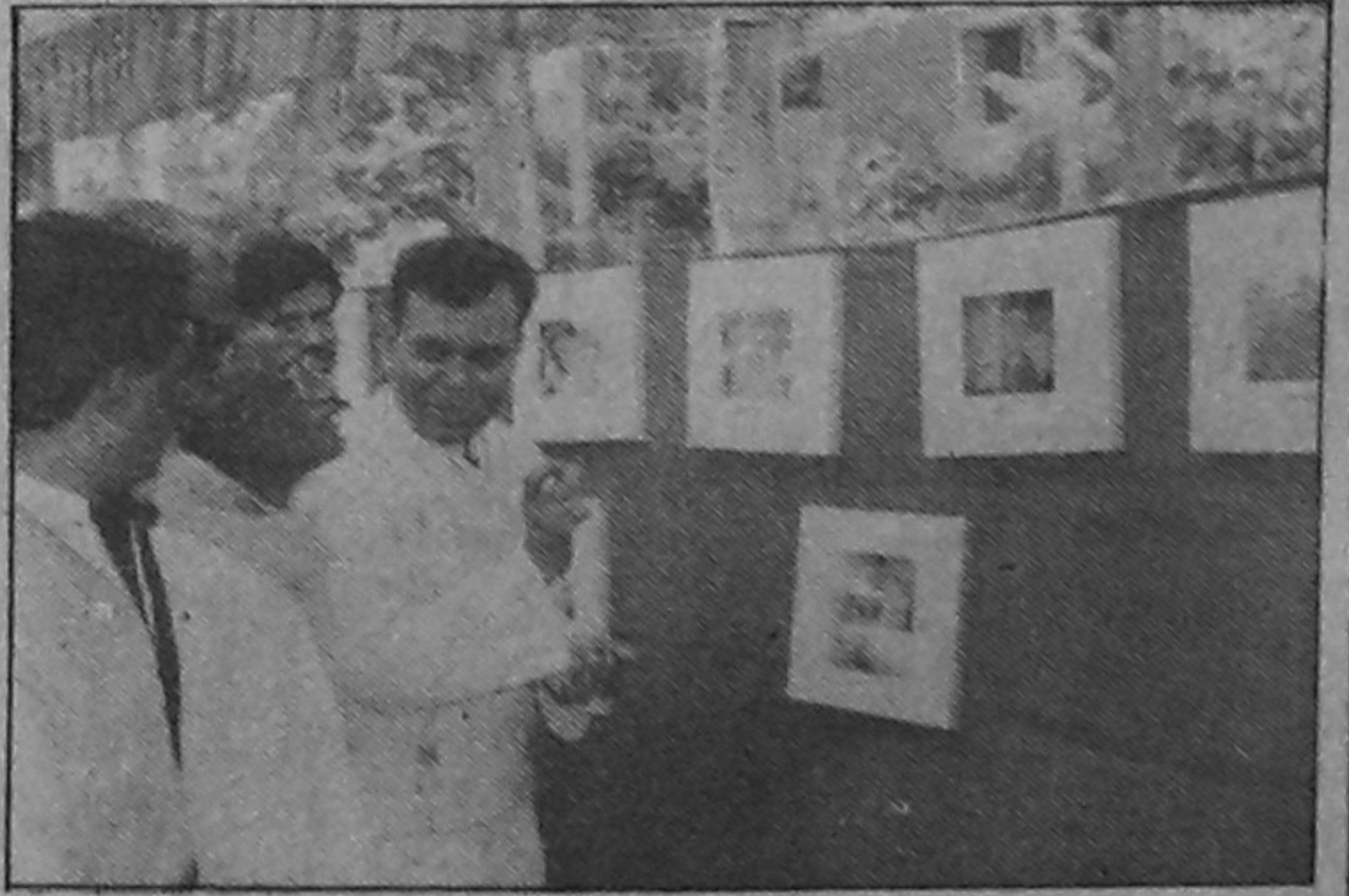
Visitors viewing a photo exhibition of journalist Hossain Seraj held recently at Magura Press Club.