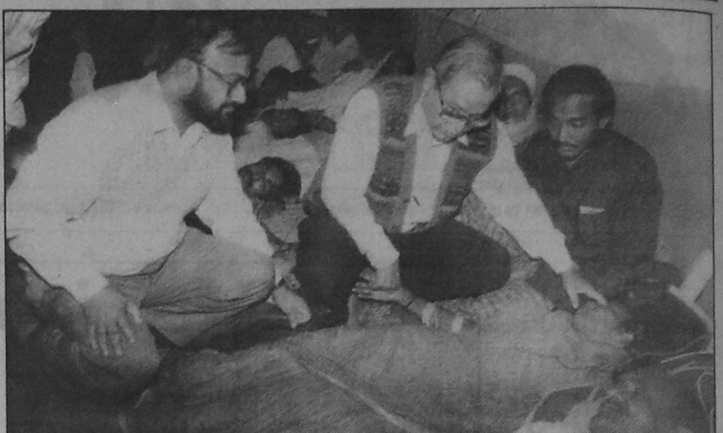
Deputy Leader of the Opposition in Parliament Badruddoza Chowdhury examines an ailing teacher at Osmani Udyan in the city where the non-government primary teachers have been staging a sit-in since Sunday. Badruddoza and other leaders of the BNP visited the teachers yesterday.

The tele-play show will be followed by a panel discussion. The programme is part of the governance and gender initiatives of the British Council. This session will be held to help raise awareness and create sensitisation on the issue of gender discrimination and forced marriage prevailing in the country.