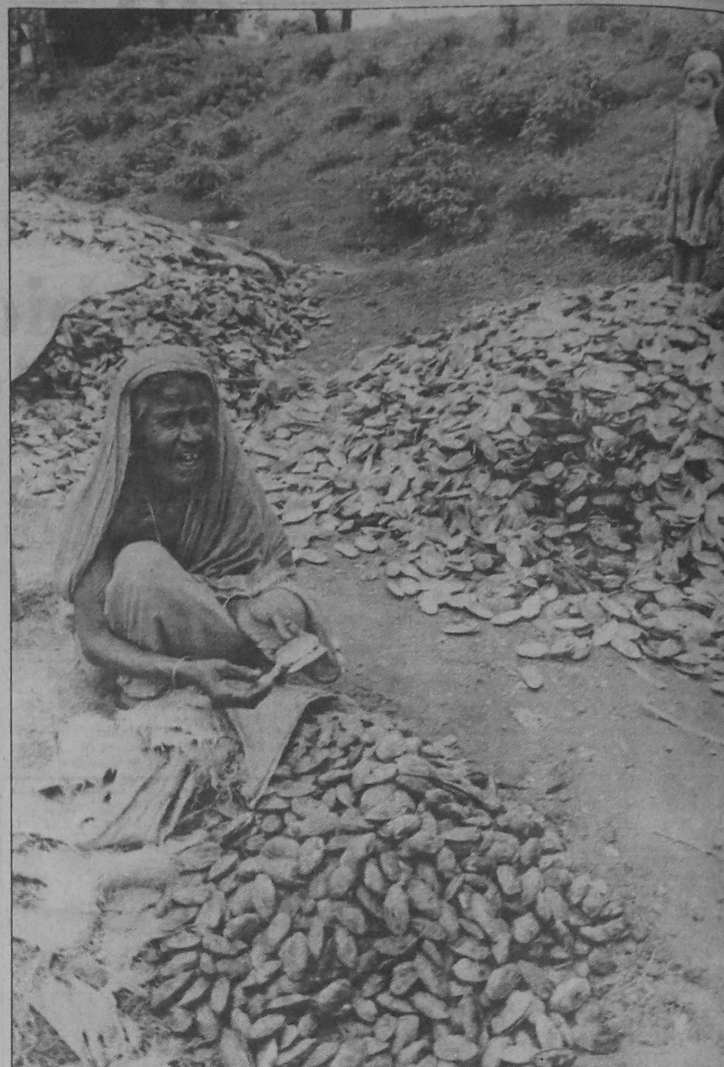
An old woman searches through a pile of oyster shells for pearls. The oysters are collected from the Buriganga. The pearls inside fetch good price for foreigners.