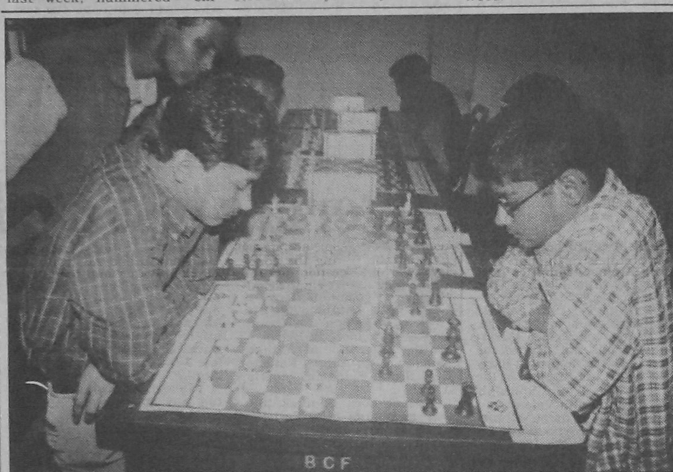
Scene from yesterday's 21st national junior championship at NSC chess room.

It was a great atmosphere out there, a great win by us," a