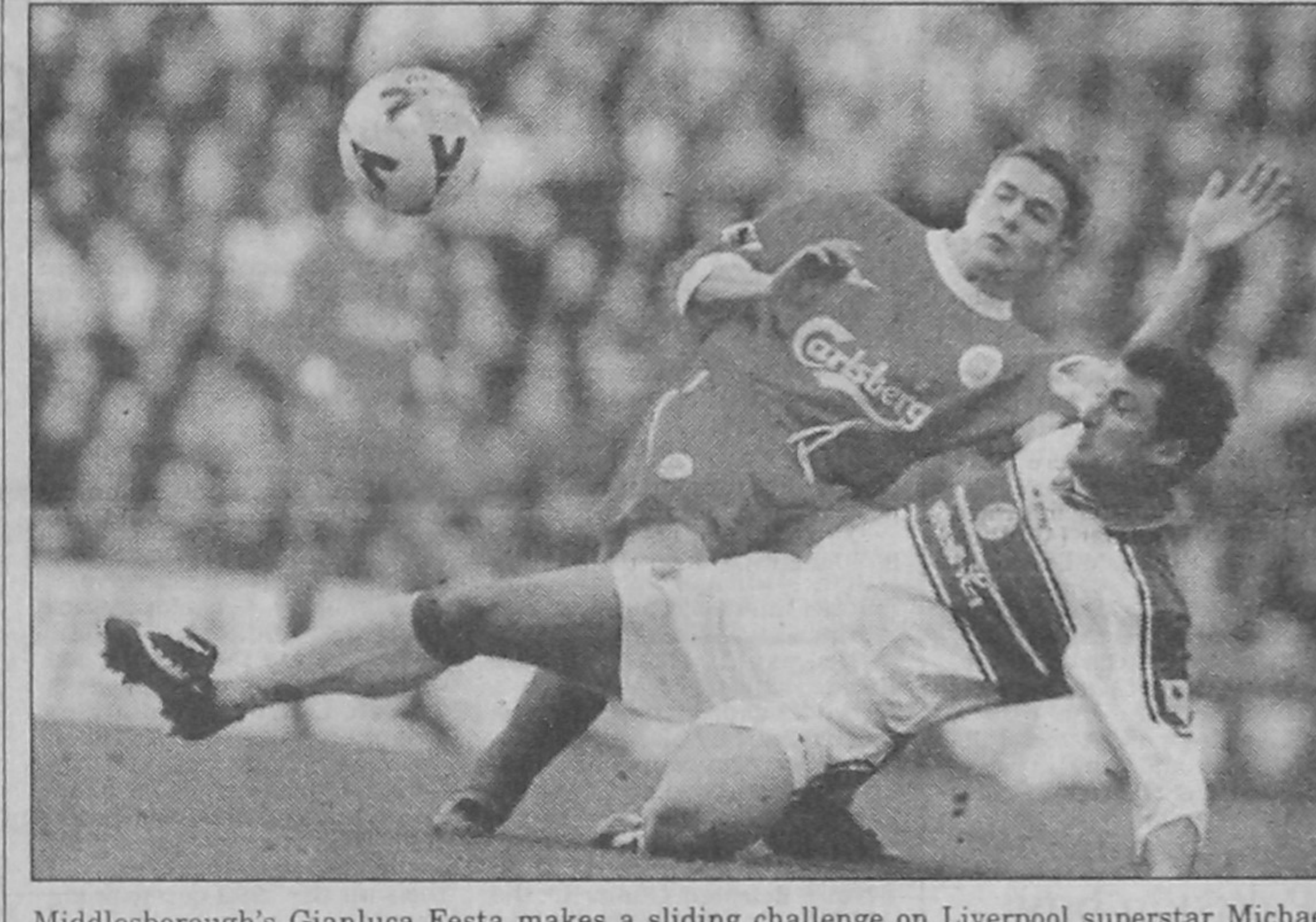
Middlesborough's Gianluca Festa makes a sliding challenge on Liverpool superstar Michael Owen during their Premiership clash at Anfield on January 22.

The final round will start at the same venue today at 1 pm.