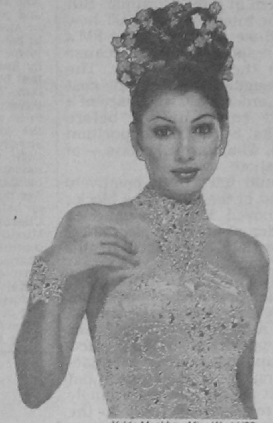
Yukta Mookhey, Miss World 99

Congratulations to yet another successful Aptechite.